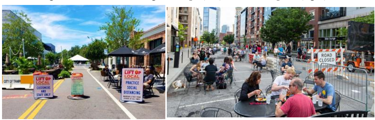
Figure 1: On-Street Dining in Tampa (left) and Indianapolis (right)

Staff has been tracking efforts in other cities where local governments are implementing or considering street dining efforts to support the recovery of local businesses. These efforts typically involve closing streets to motor vehicles in order to provide space for restaurants or retail stores to expand their activities onto the roadway while facilitating social distancing by patrons, pedestrians, and active transportation users. Examples include the planned Al Fresco program in San José; Lift Up Local in Tampa, Florida; and similar programs under consideration in San Mateo, Redwood City, Palo Alto, and Jersey City. Scenes from already implemented programs (outside of California) are displayed in Figure 1.