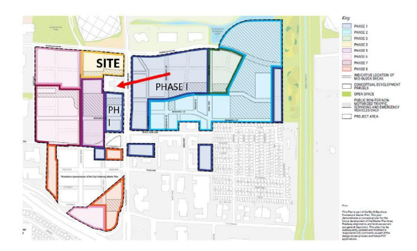
Figure 5 GOOGLE FRAMEWORK MASTER PLAN PHASING PLAN