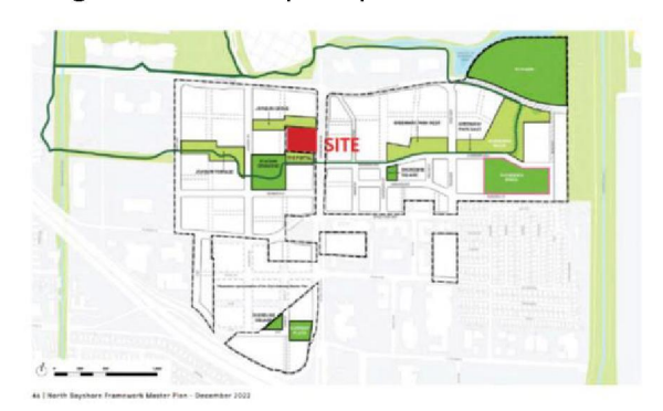
Project Enhances Google's Open Space Plan