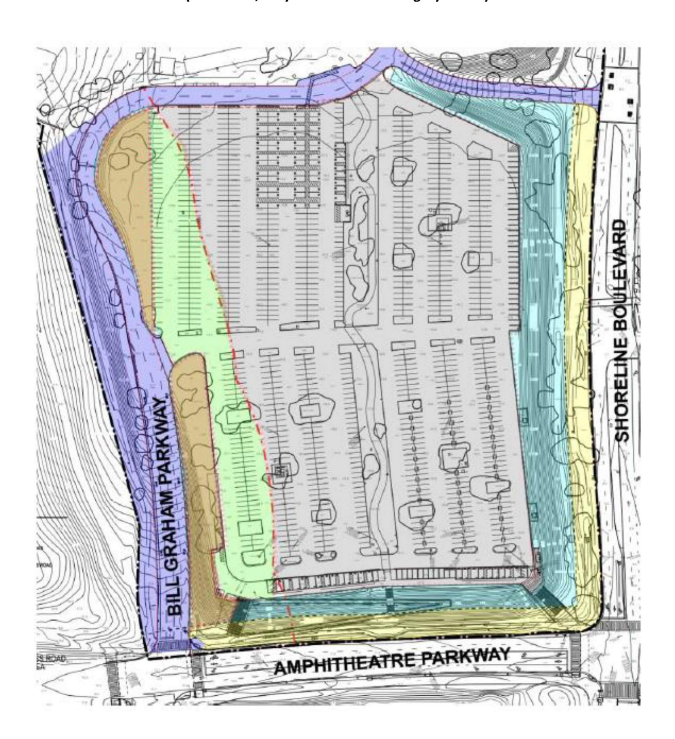
Exhibit A Option Property (±8.4 acres; only the area shown in gray below)