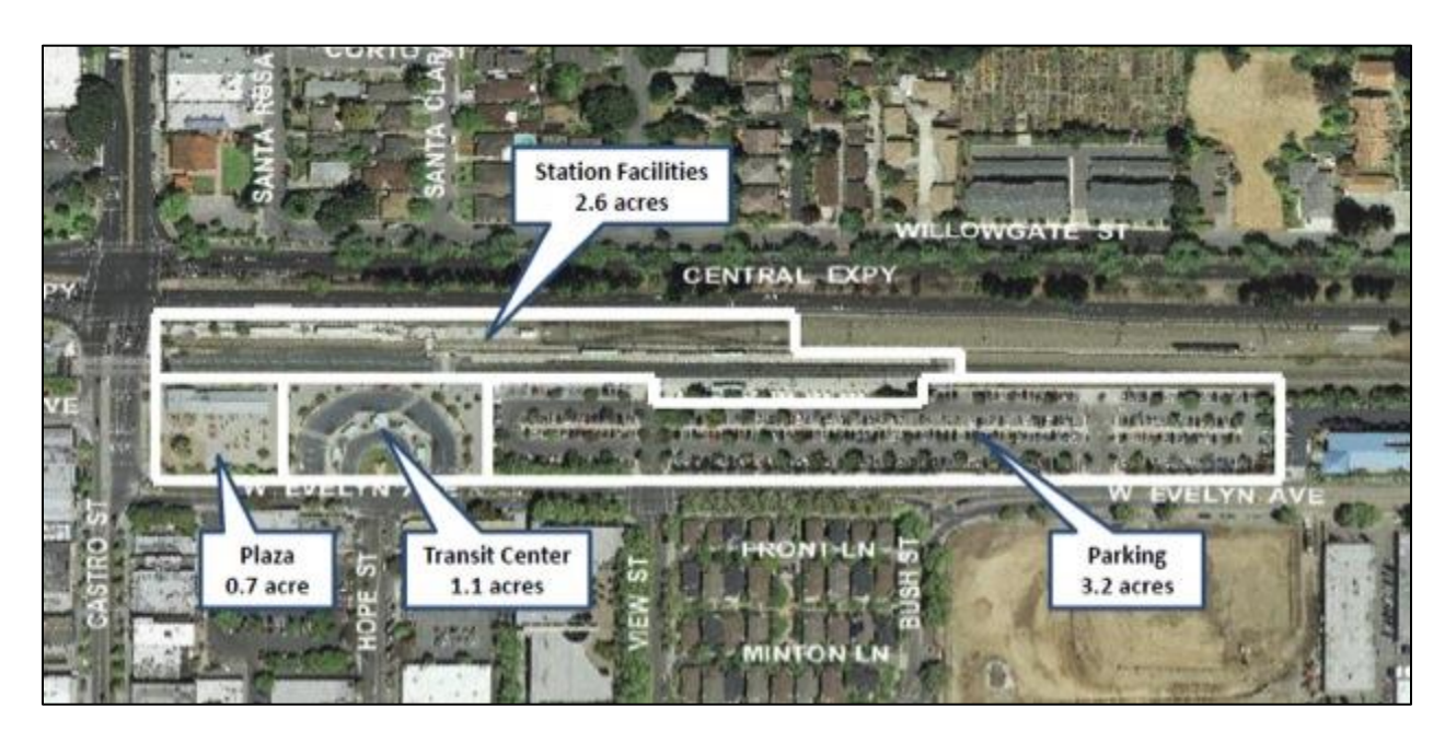
Figure 1 – Mountain View Transit Center

The parking lot is also used by Transit Center users for passenger pick up and drop off, and for some shuttle drop offs. It serves as the site of the Farmers' Market on weekends, except on San Francisco 49er football game dates. For 49er games and other events at Levi's Stadium, the lot, with special event pricing, serves those attending the events on VTA light rail and buses.