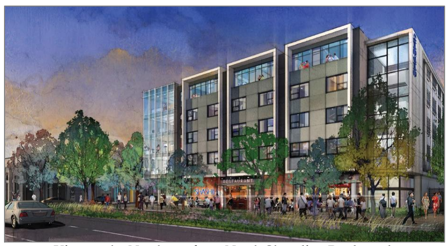
View to the Northeast from North Shoreline Boulevard