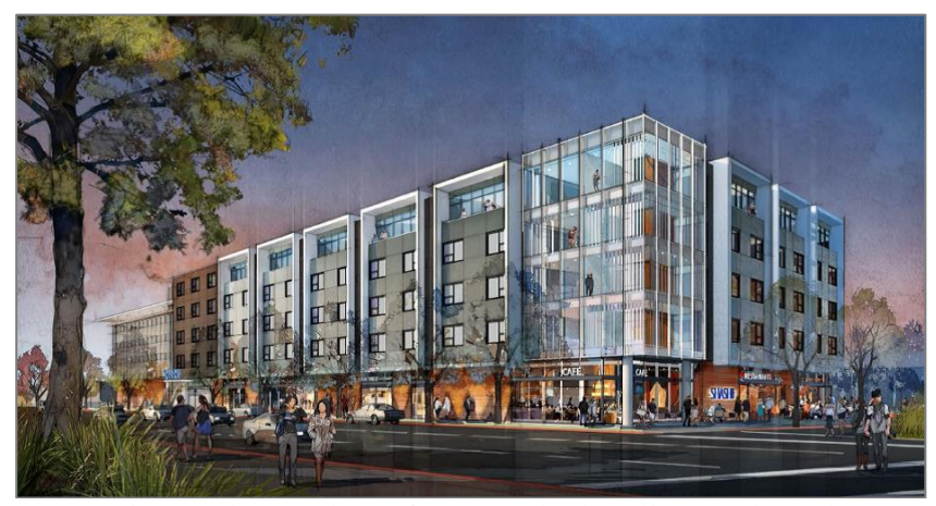
View to the Southeast from North Shoreline Boulevard

The proposed architectural design is modern in style, with materials consisting of cement plaster walls, metal wall panels, metal frames and trim, wood, and glass curtain walls. hotel building The rectangular in shape and located close to streets, with upper stories overhanging the ground floor slightly to create pedestrian arcade. Along North Shoreline Boulevard, upper-story building walls are located approximately 1' from the property line, with ground-floor setbacks ranging from 5' to 12'. Along Space Park Way, upper stories are set back approximately 2' from lines property with ground-floor setbacks of approximately 5'. This is