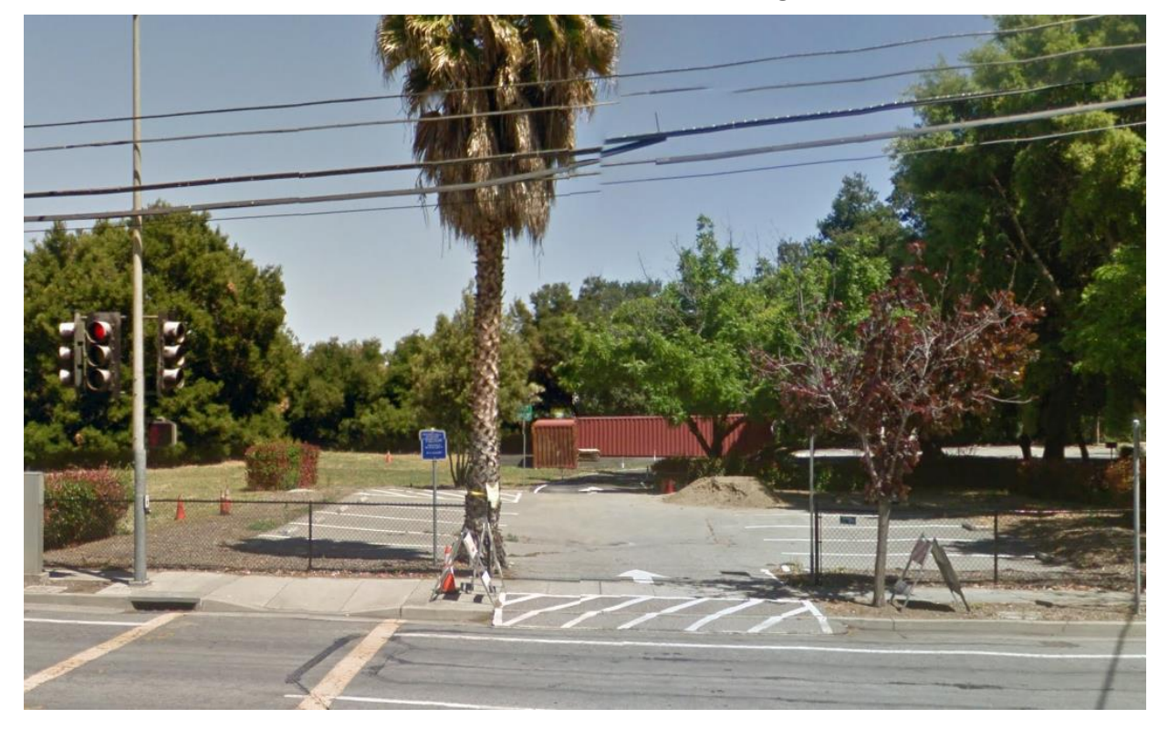
Figure 5 – Potential MOC RV Dump Site Location – View from Whisman Road Looking East

A potential issue unique to this site includes the possibility of attracting RVs to the adjacent residential neighborhood for convenient access to the RV waste dump facility. Police and Fire Department staff have also expressed concerns about noise and other impacts to the adjacent dorms as well as proximity to the active, live fire training facility that would occur with a waste dump facility at this MOC location.