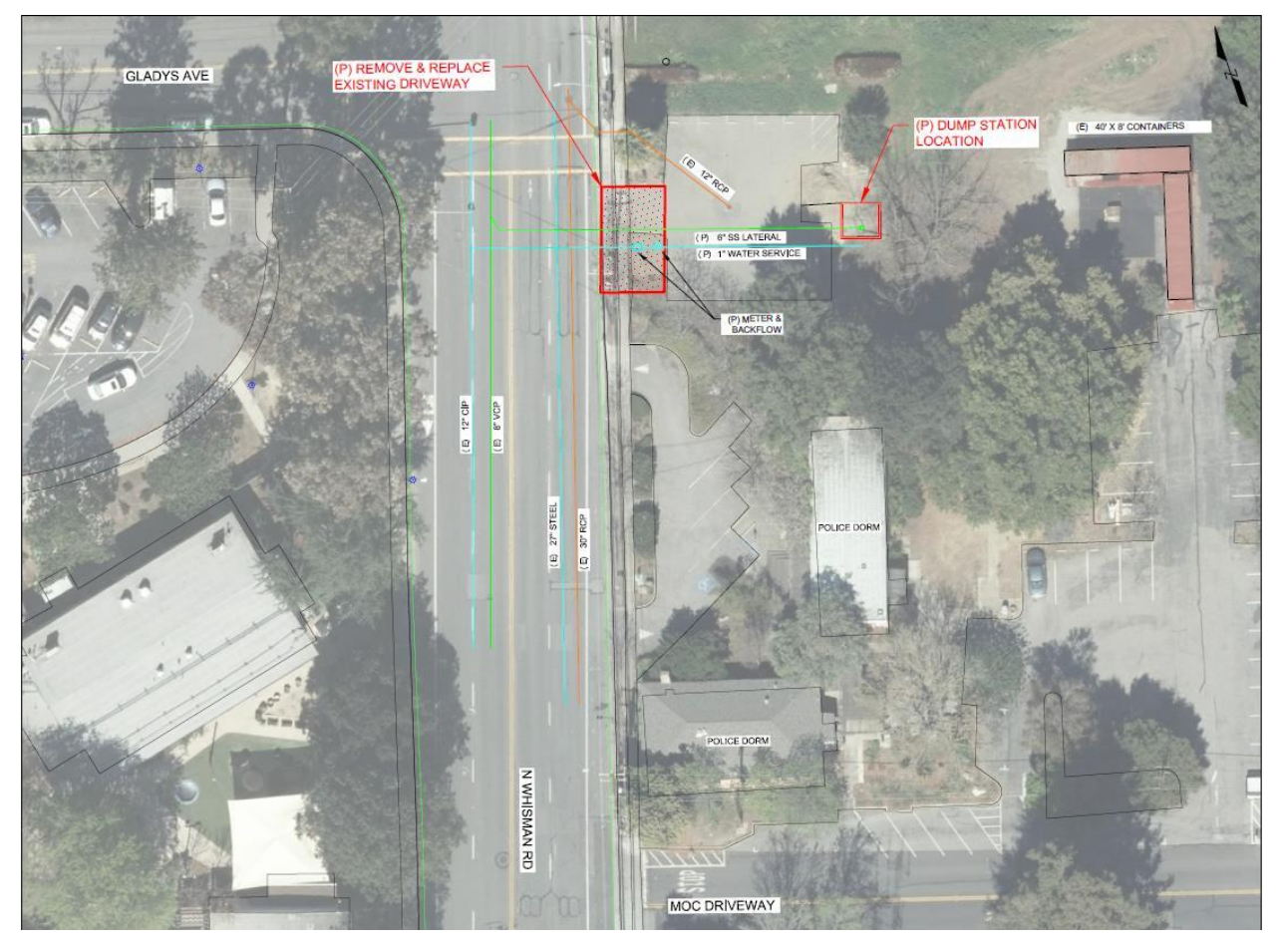
Figure 6 – Conceptual Site Plan for RV Dump Site Adjacent to Whisman Road MOC