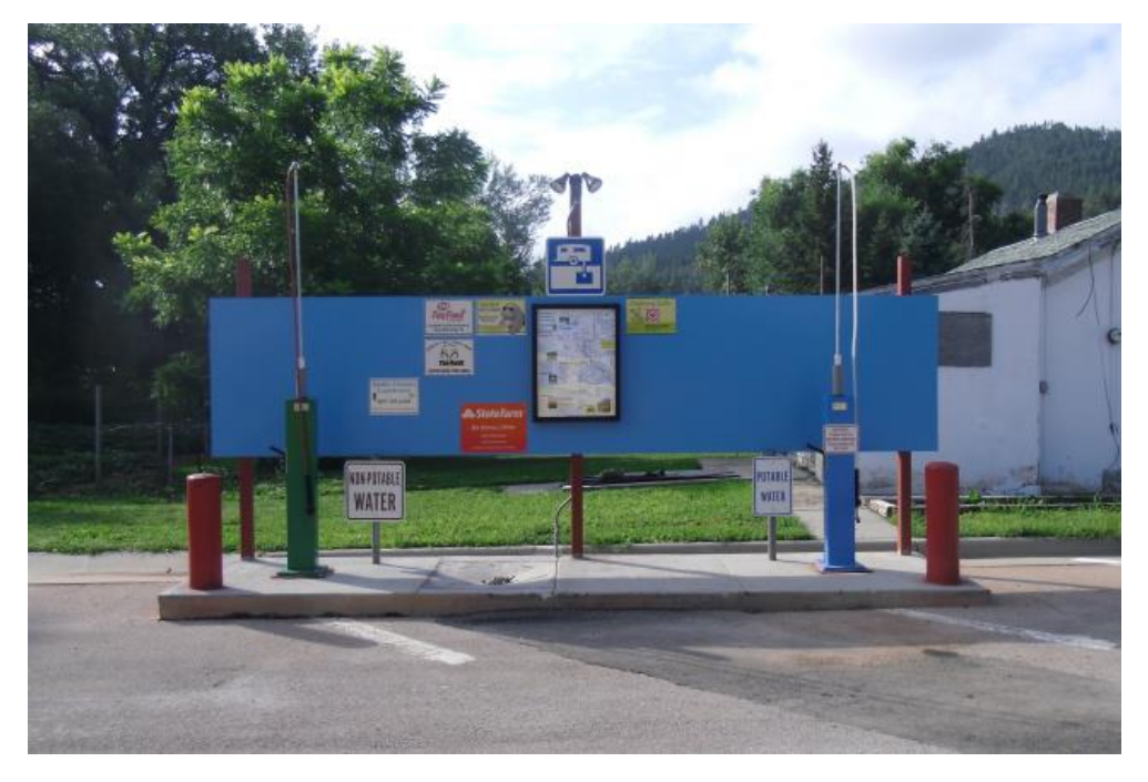
Figure 2 – Dump Station with At-Grade Sewer Connection