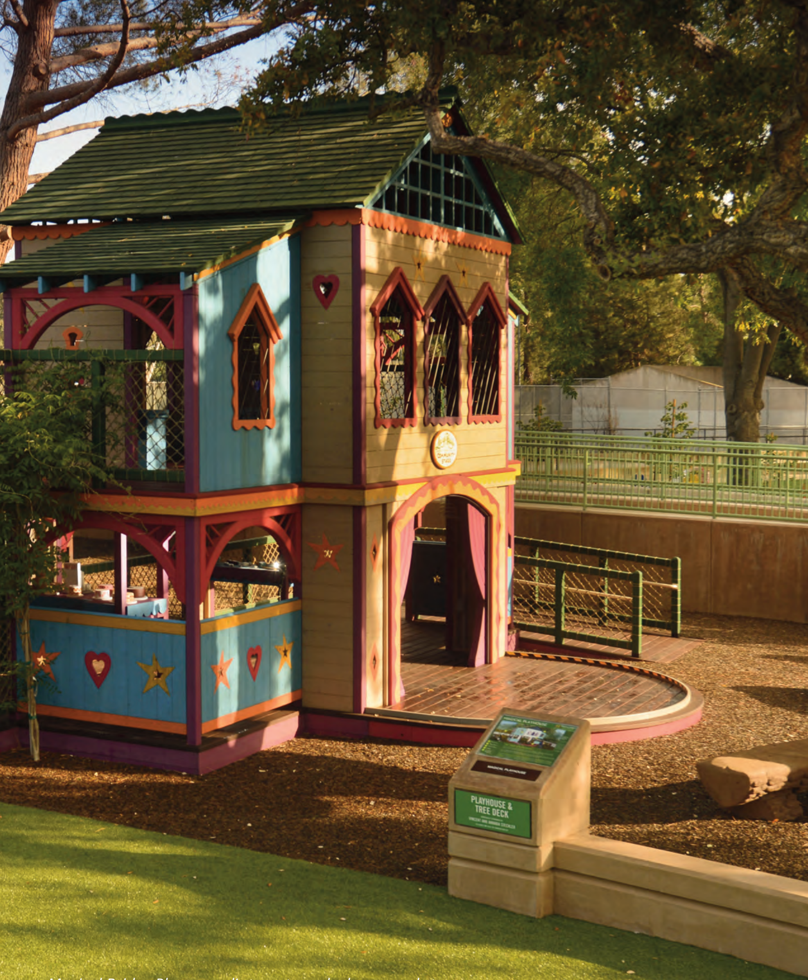
Magical Bridge Playground's two-story playhouse and stage, custom designed by Barbara Butler Artist-BUILDER, Inc.