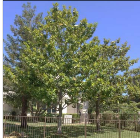
Photo 4: Southern magnolia #174 was in good condition with good form and structure.

Southern magnolias made up 5% of the population with 21 trees. Magnolias were in good (16 trees) and fair condition (five trees). Trees in good condition had good form and structure and slightly thin crowns (Photo 4). Trees in fair condition had thinning crowns and/or poor color.