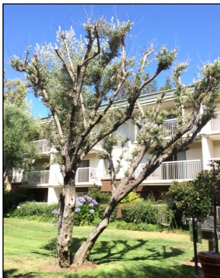
Photo 1 (far left): Olive #318 had been previously topped at 15', but had a full, dense crown and was in good condition.