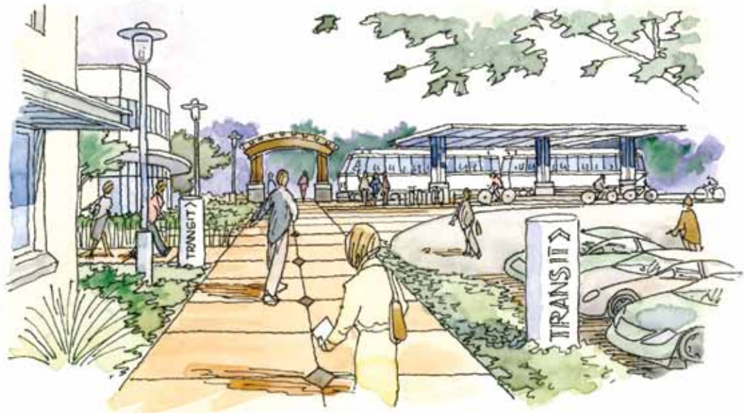
Pedestrian connections to transit