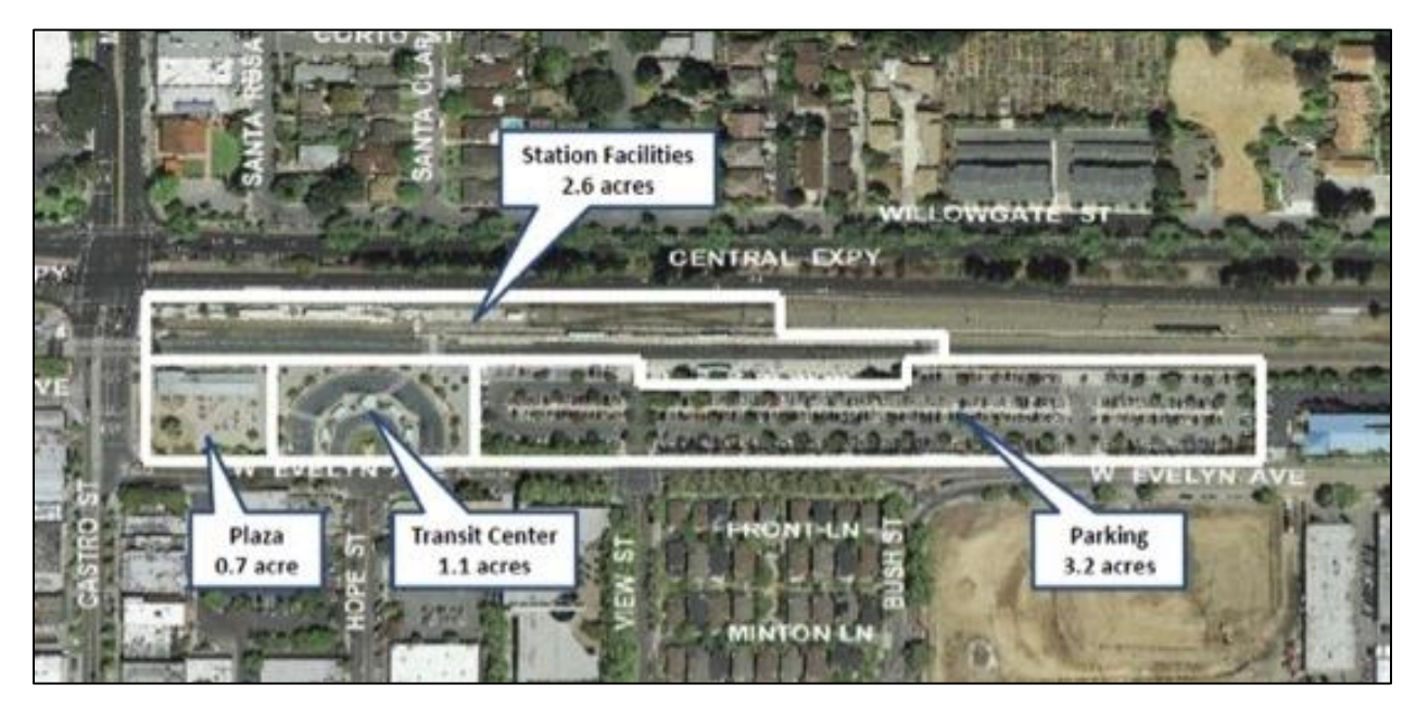
Figure 1 – Mountain View Transit Center

The City Council approved the development of a comprehensive Master Plan for the Mountain View Transit Center (Transit Center—Figure 1) in November 2014. The Transit Center now serves more than three times the original expected number of riders, and substantial further growth is expected with Caltrain electrification.