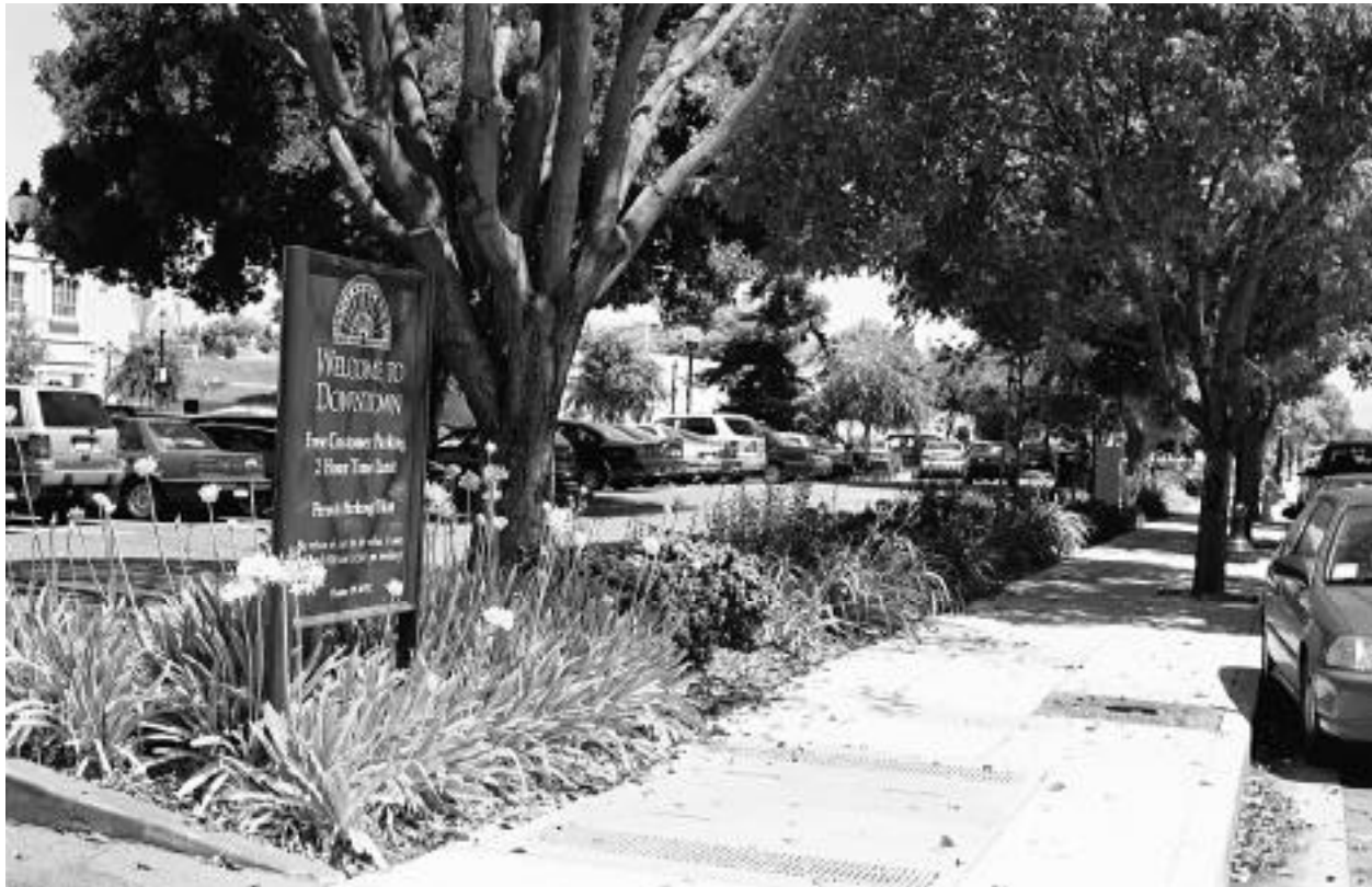
Convenient and well-designed Downtown parking.