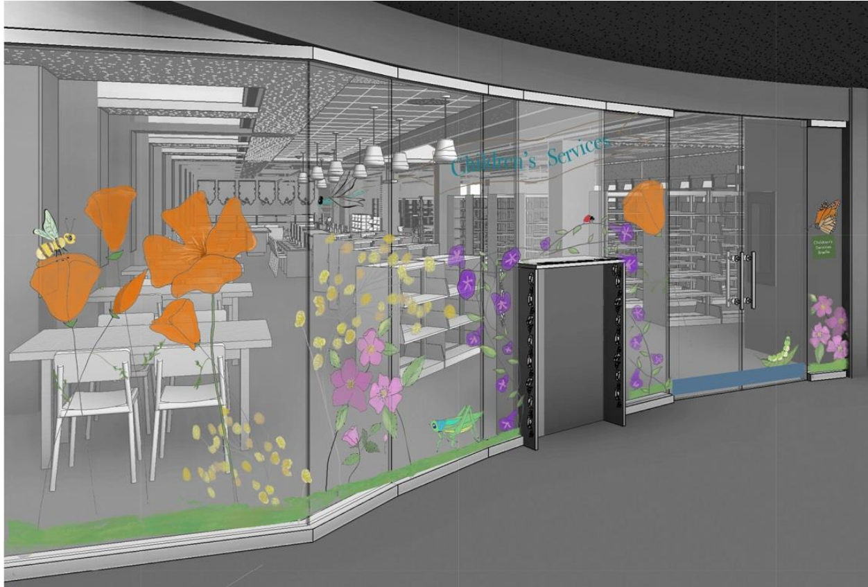
Figure 2 – Artist Rendering

California, including wild California roses, naked buckwheat, morning glories, and California poppies. It also includes various insects (see Figure 2 – Artist Rendering).