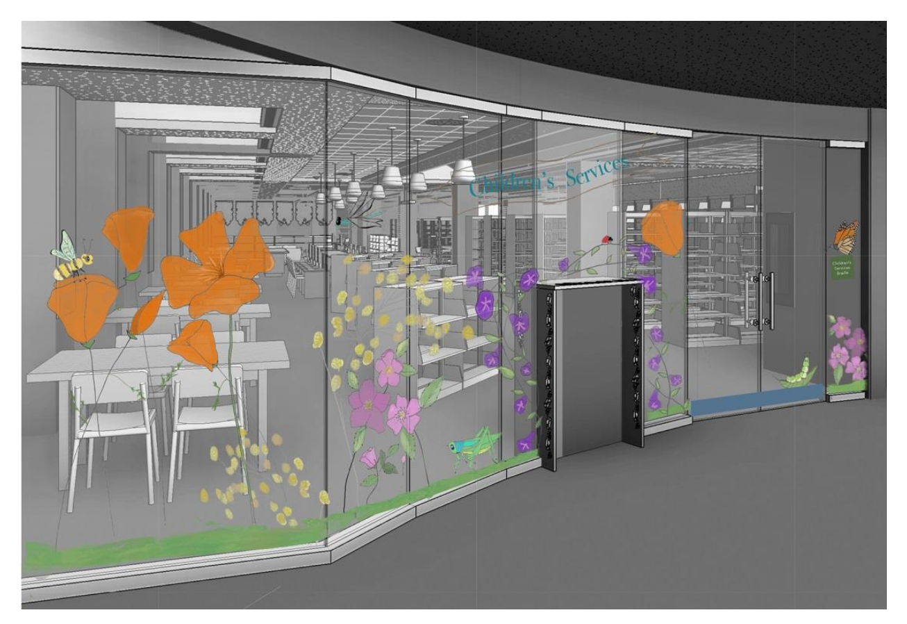
Figure 2 – Artist Rendering

California, including wild California roses, naked buckwheat, morning glories, and California poppies. It also includes various insects (see Figure 2 – Artist Rendering).