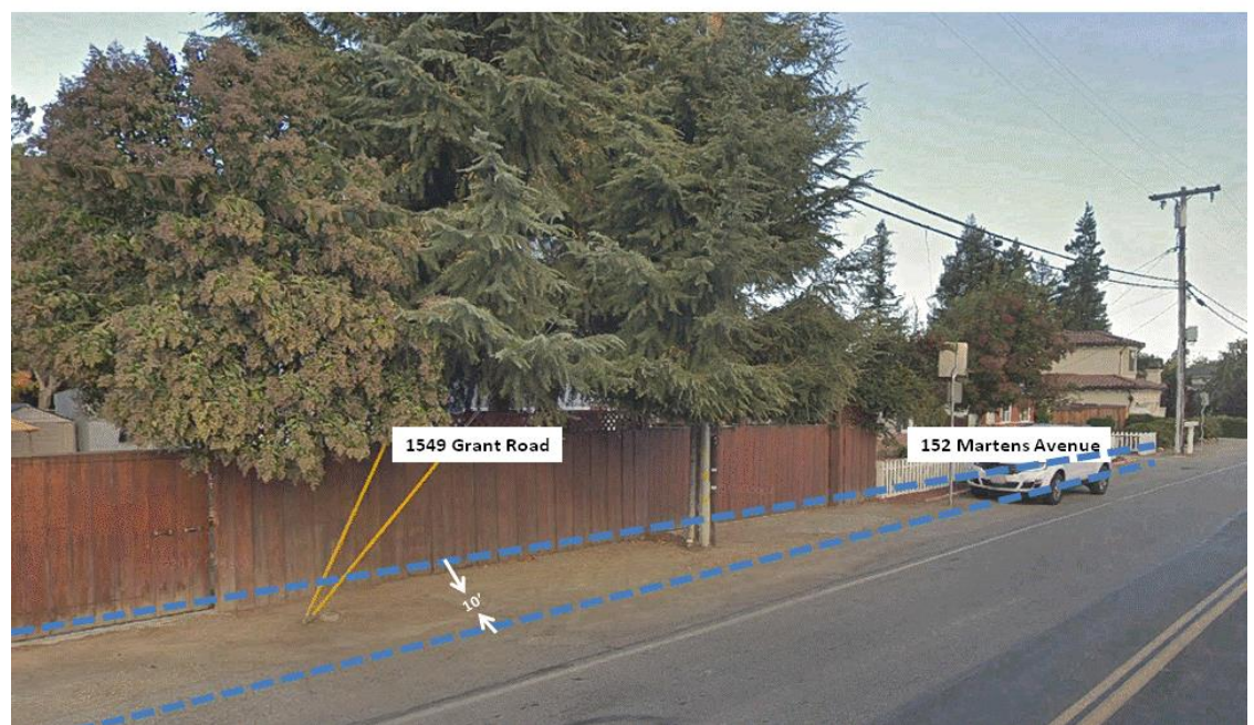
Figure 1 – Existing Condition

Installation of the sidewalk on the north side of Martens Avenue will require the acquisition of 10' wide street easements from 1549 Grant Road (corner of Grant Road and Martens Avenue) and 152 Martens Avenue. The existing condition without sidewalk is shown in Figure 1. As can be seen, the easement is primarily outside of the currently used property area and frequently used by bicyclists and pedestrians. The acquisition areas are shown on the attached plat maps (Attachment 1). As part of the project construction, both the redwood fence on the Martens Avenue frontage of 1549 Grant Road and the white picket fence in front of 152 Martens Avenue will be installed new to match existing fences at the new right-of-way line, which is approximately 2' from the existing location. Part of the driveways for the two properties will also be reconstructed to match the sidewalk grade.