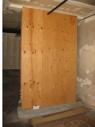
New stand-alone wood shear wall with new concrete footing