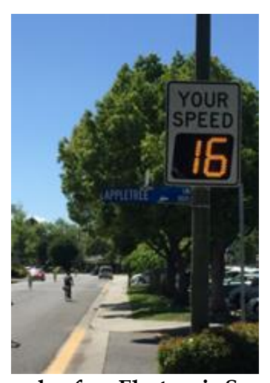
Figure 1 – Example of an Electronic Speed Radar Sign

The following Figures 1 through 3 show examples of each of the proposed improvements.