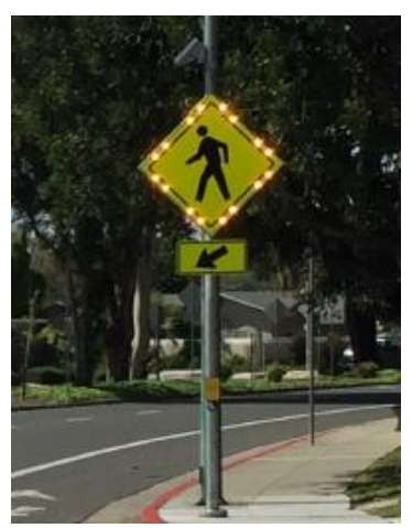
Figure 3 - Example of LED-Enhanced Pedestrian Crossing Sign

The estimated project cost is as follows: