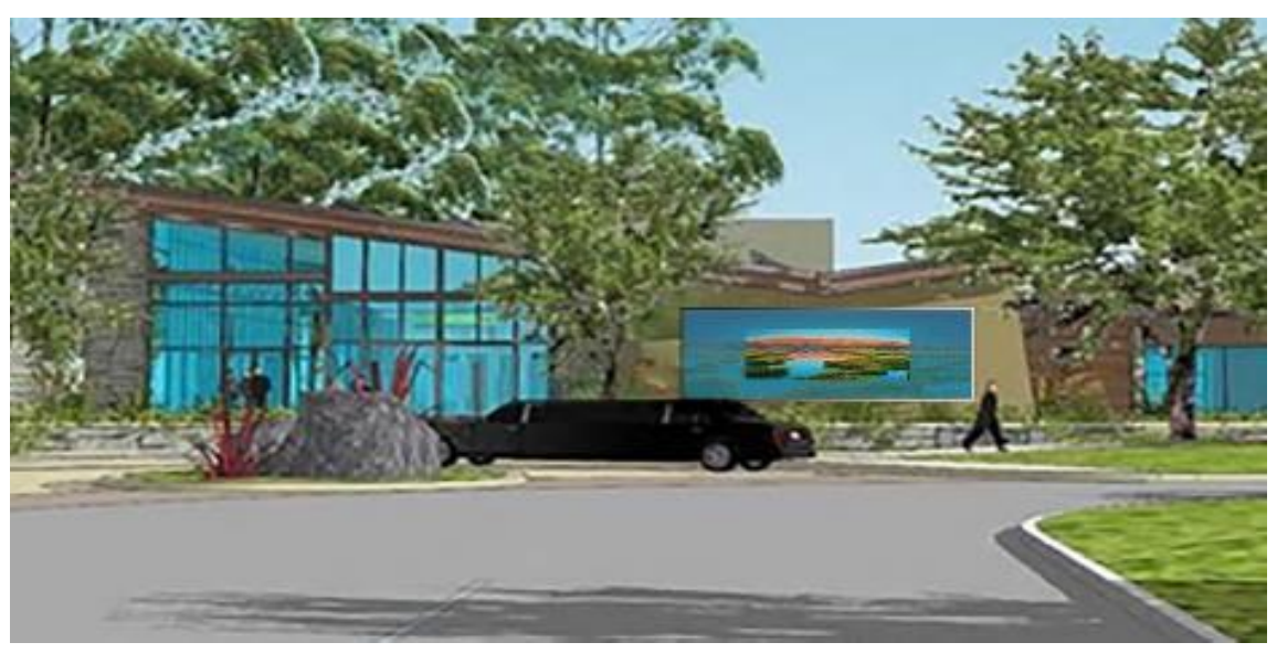
View from Main Entrance Drive Aisle