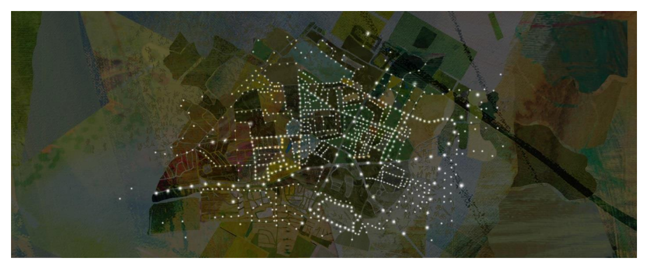
Original Art Proposal – Night View

A problem arose during the artists' feasibility of the lighting element pertaining to the proposed art work as depicted above. Prior to commencement of construction in August 2017 and at regular intervals since, staff has been working with the artist to assist them in development of a workable solution to their proposed exterior public art installation. Throughout this time frame, the artist's approach and method of achieving their design goals continuously evolved as they explored various technical and aesthetic solutions—none of which had been previously attempted or executed by the artist.