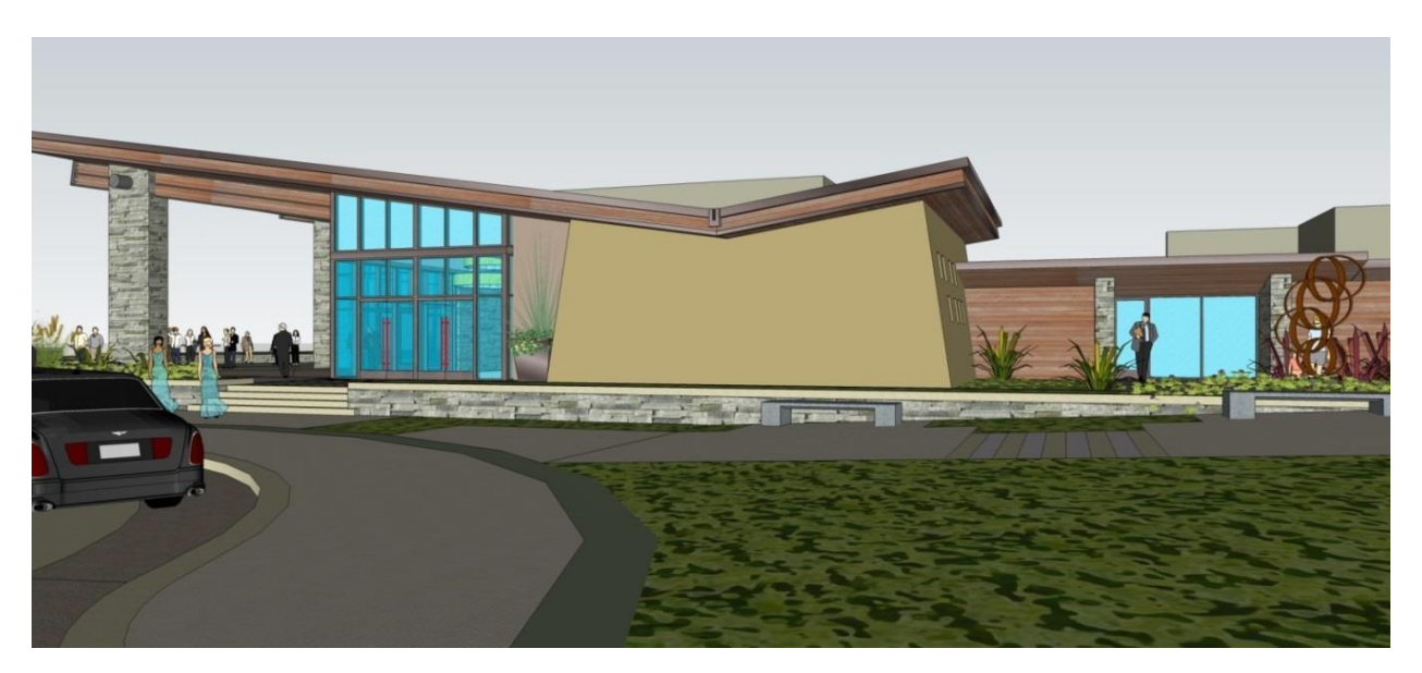
Site 1, Exterior Wall