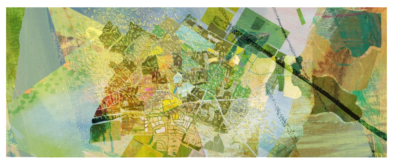
Original Art Proposal - Daylight Hours