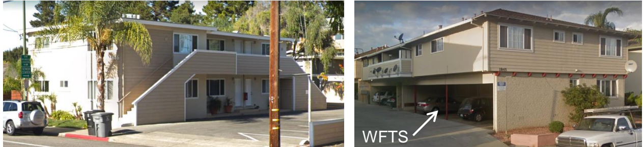
2-story, 6-unit buildings. Left: No WFTS. Right: WFTS, "Long Side Open" type.

3-unit buildings. Left: 1-story, no WFTS. Right: WFTS, "House Over Garage" type.