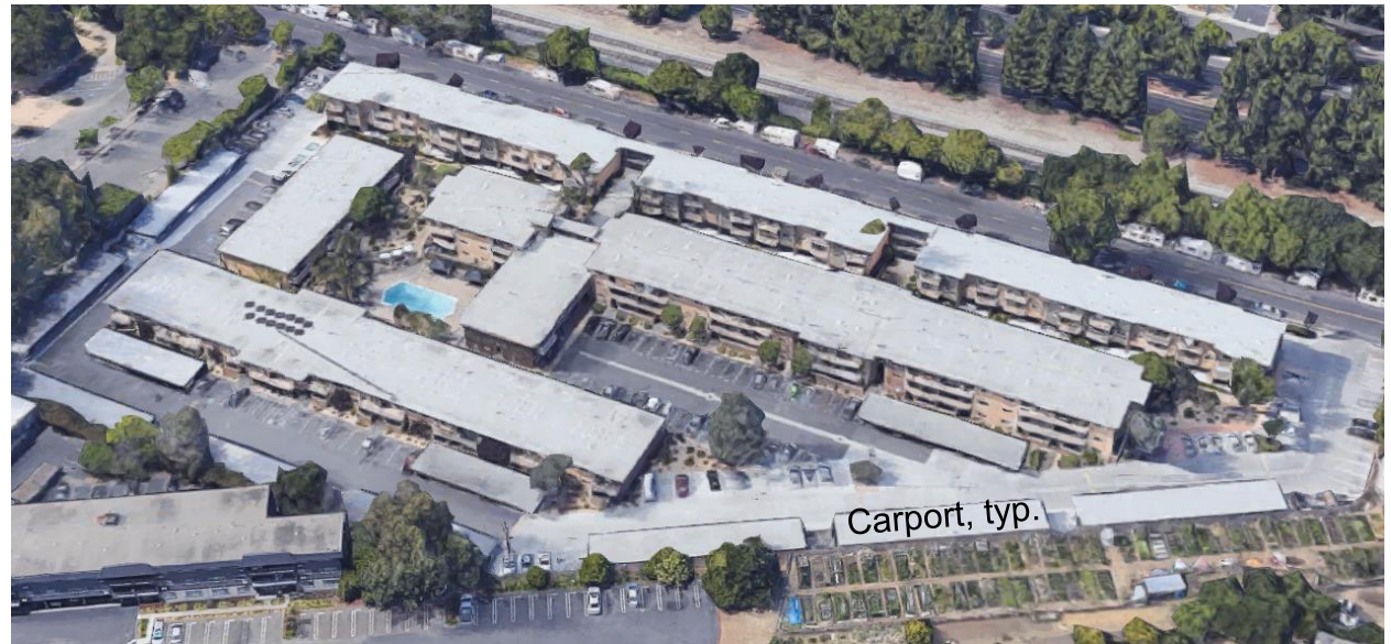
Multiple large buildings. No WFTS; parking spaces in adjacent surface lots, some under carports.

Three 2-story buildings (13 units total). No WFTS; parking provided under adjacent carports.