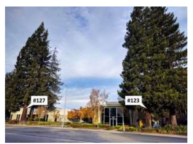
Figure 2—Two Trees on Shoreline Boulevard to be Removed