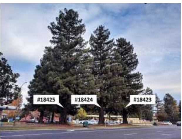
Figure 3—Three Trees on Middlefield Road to be Removed