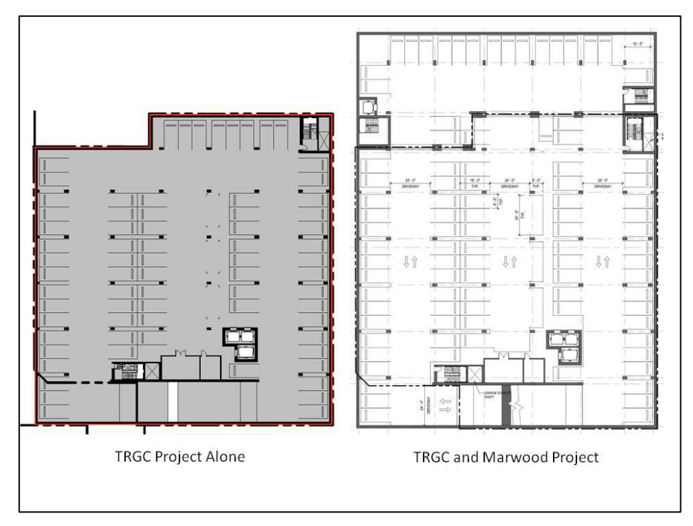
Parking Garage Plans

Marwood proposes to transfer ownership of the land to TRGC (so TRGC can construct and manage the garage), but Marwood would retain development rights over the garage and parking rights in the garage in perpetuity. These parking rights, and the necessary access to them through the City's land, represent a new encumbrance on the City's property, which will constrain how the City may use Lot 4 in the future. The City is still negotiating the terms of that encumbrance, based on the framework established at the March and October 2018 Closed Sessions, but Marwood has offered, as one form of payment, that a portion of their parking spaces will be public parking (available 24 hours a day, 7 days a week, and not used by their tenant).