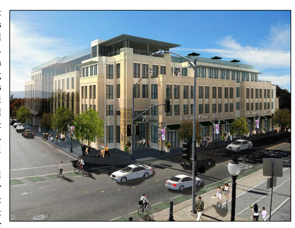
Perspective from Transit Center

The project's current design includes several traditional design features. including utilization of traditional building materials such limestone and sandstone; ornamental elements like parapet caps, water table. awnings, and pedestrian-scale landscaping and lighting; and a regular rhythm of inset windows. The project highlights the corner with a small entrance