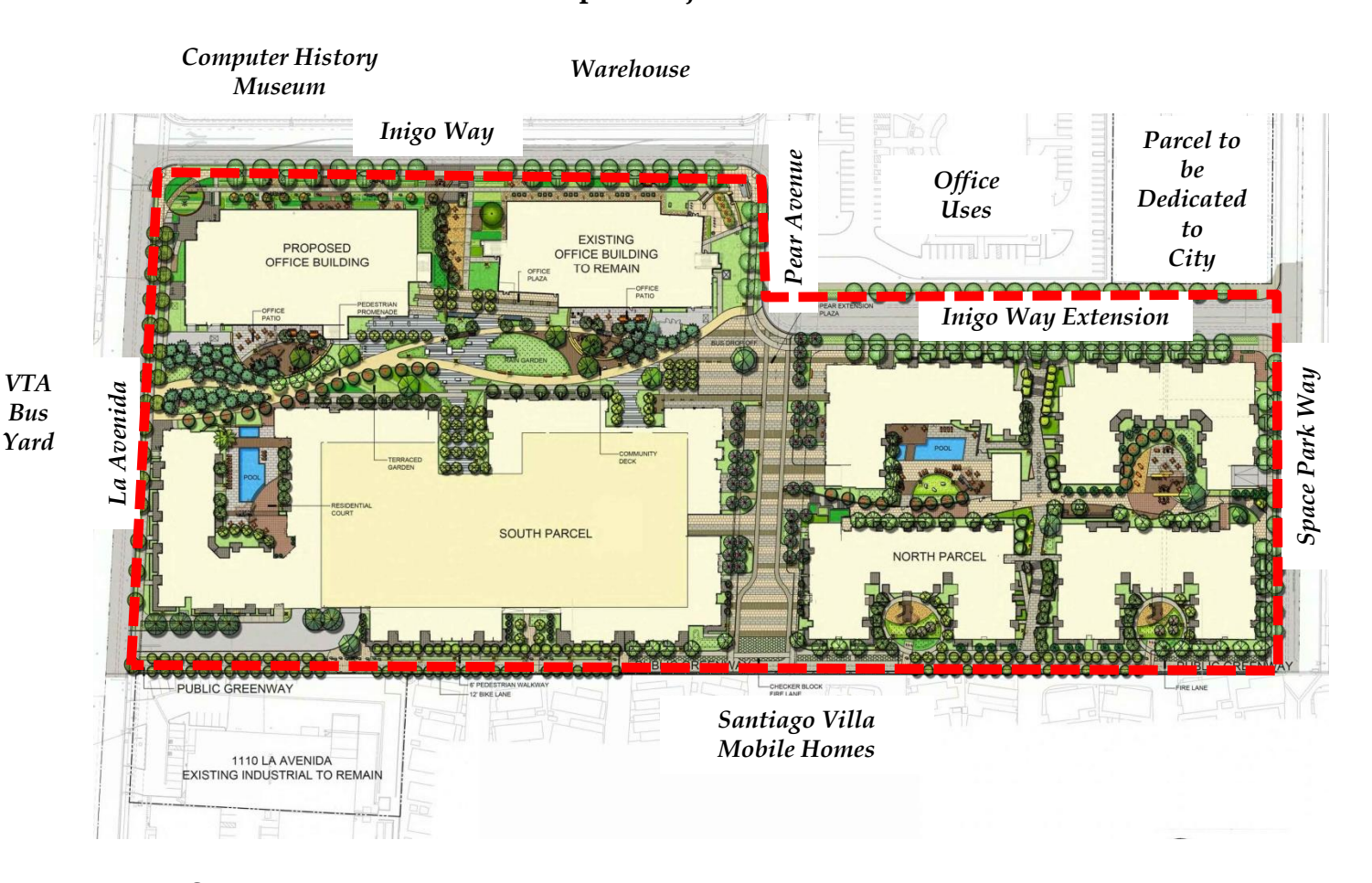
Map 1: Project Site

The following map shows the location of the proposed project (outlined in red), including surrounding streets and land uses: