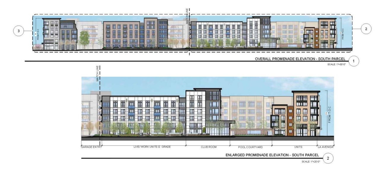
Principle No. 8: Design corner buildings to emphasize an entry, shape a public space, or provide a unique building image. Most buildings include corner elements with entries, lobbies, or unique architectural elements, with some opening up to pedestrian areas.

1255 Pear Avenue Mixed-Use Development Project, Summary Vacation of Public Easements, and Direction Regarding Potential Amendments to the Parkland Dedication Ordinance October 23, 2018 Page 14 of 31