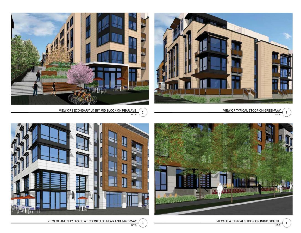
Principle No. 4: Vary building massing to shape space and enhance building and neighborhood character. The buildings use design strategies such as varied height, breaks, recesses, step-backs, and projections such as bay windows and balconies to create interest and variety throughout the project.

Principle No. 2: Create high-quality public frontages. The project's public street frontages are well designed to include street trees, landscaping, and pedestrian-oriented elements.