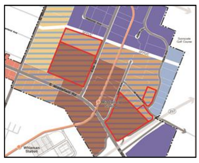
Additional Residential Areas