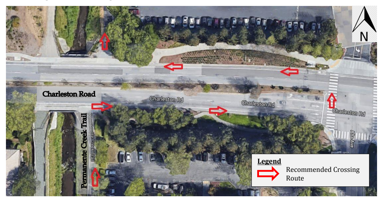
Figure 1: Existing Condition at Permanente Creek and Charleston Road

Charleston Road Crossing at Permanente Creek Trail, Project 14-38 – Amend Project Budget, Approve Plans and Specifications, and Authorize Bidding June 25, 2019 Page 2 of 5