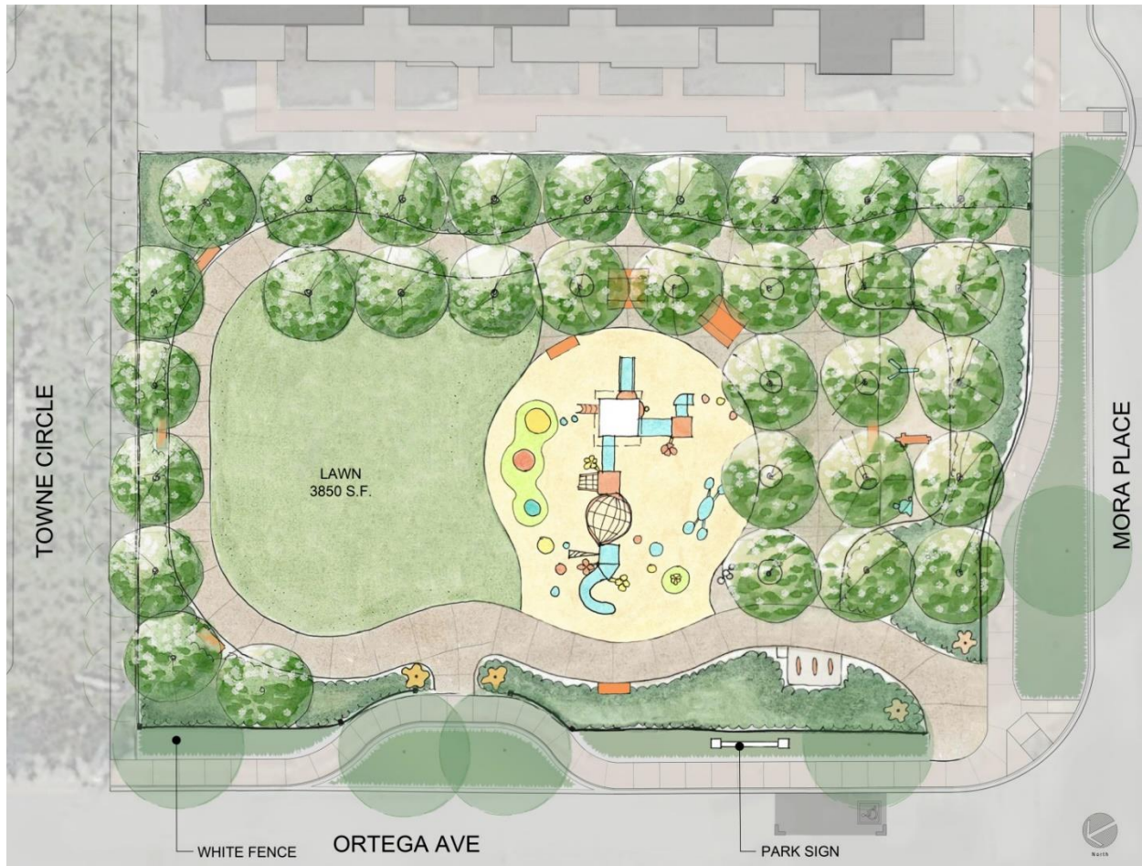
Figure 2 – Recommended Concept

As with other mini parks, no overhead lighting is included because the park closes at sunset. One accessible parking stall will be added along the street frontage on Ortega Avenue. A short perimeter fence and permeable concrete pathways will be installed to accommodate City vehicles for maintenance.