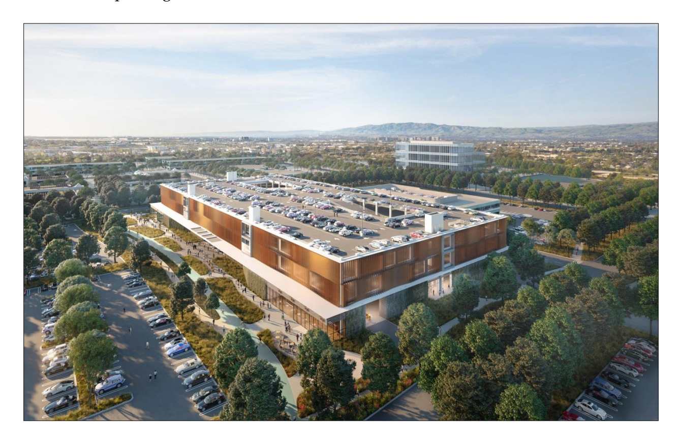
Huff Parking Structure

The off-site parking structure on Huff Avenue is four stories and 58' in height and is situated adjacent to the green loop path in North Bayshore. The overall building footprint is 566'x274' and includes 1,792 parking spaces and ground-floor retail facing the green loop. Additional discussion on the project's overall parking strategy follows below in the parking section.