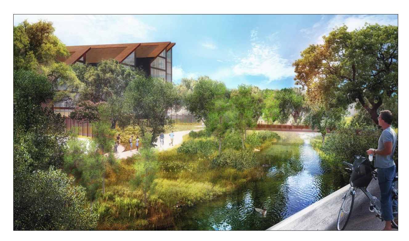
Office Building Viewed from Permanente Creek

As for the parking structure, the Precise Plan recommends a maximum height of 55' as a guideline, and the proposal features a height of 58', not including elevator and stair towers. Google states that the additional height was needed in order to make the structure flexible to a number of uses, including residential, should parking not be needed in the future.