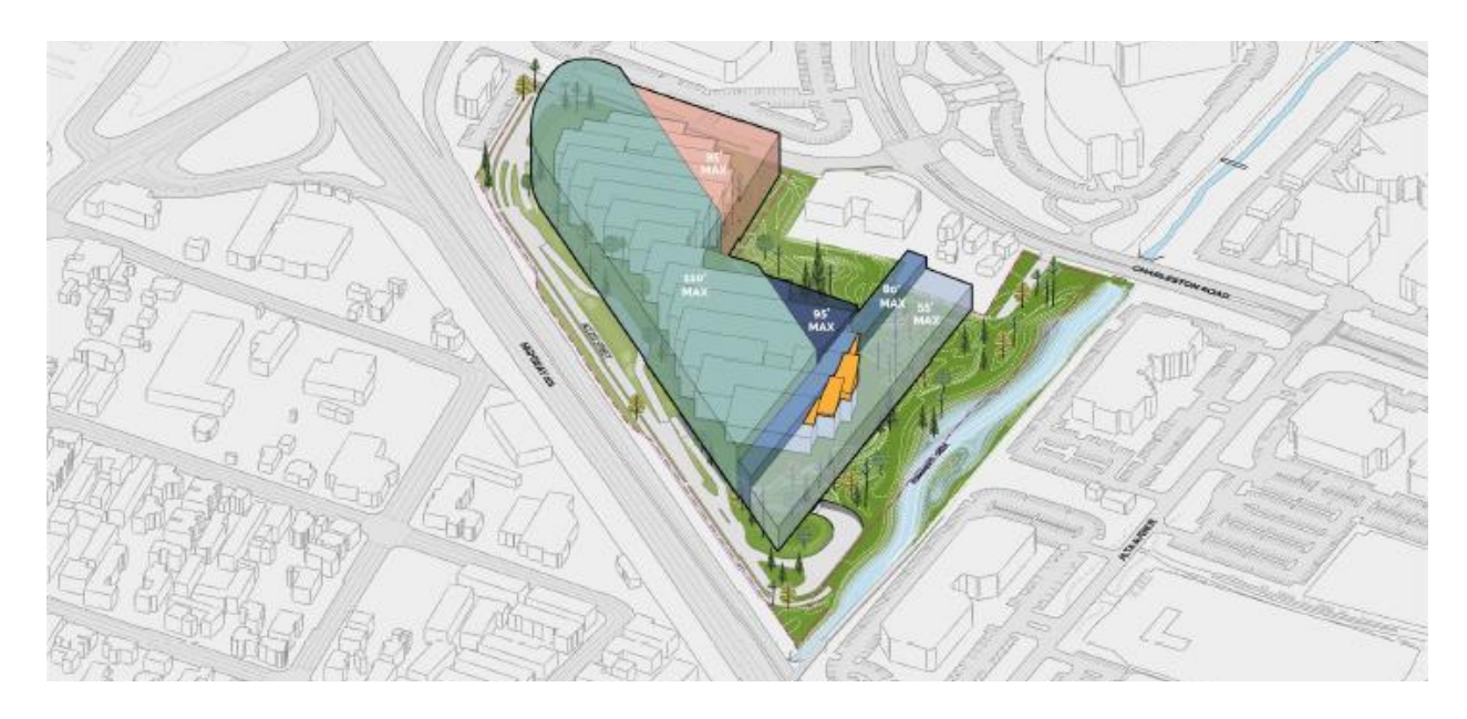
Office Protrusion into the 55' Height Limit (in yellow)

Google reasons in the plans that the overall building area proposed within this 100' encroachment area has significantly less square footage than what is allowable. Google believes that the extension over the maximum height guideline results in a superior project while also meeting the intent of the Precise Plan by providing a net ecological benefit. Google states that the project is establishing native habitats along the creek, removing the existing surface parking, and creating extensive habitat restoration.