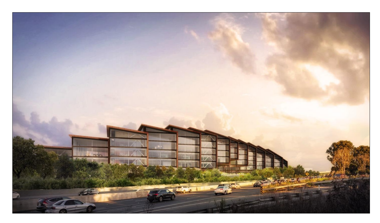
Proposed Office Building

Google states that they learned from Charleston East and that the current design responds better to the natural environment and the Precise Plan's sustainability goals than the initial design. The current design also does not require complex design and engineering solutions to construct the building, while it creates a greater diversity of high-end architecture in North Bayshore.