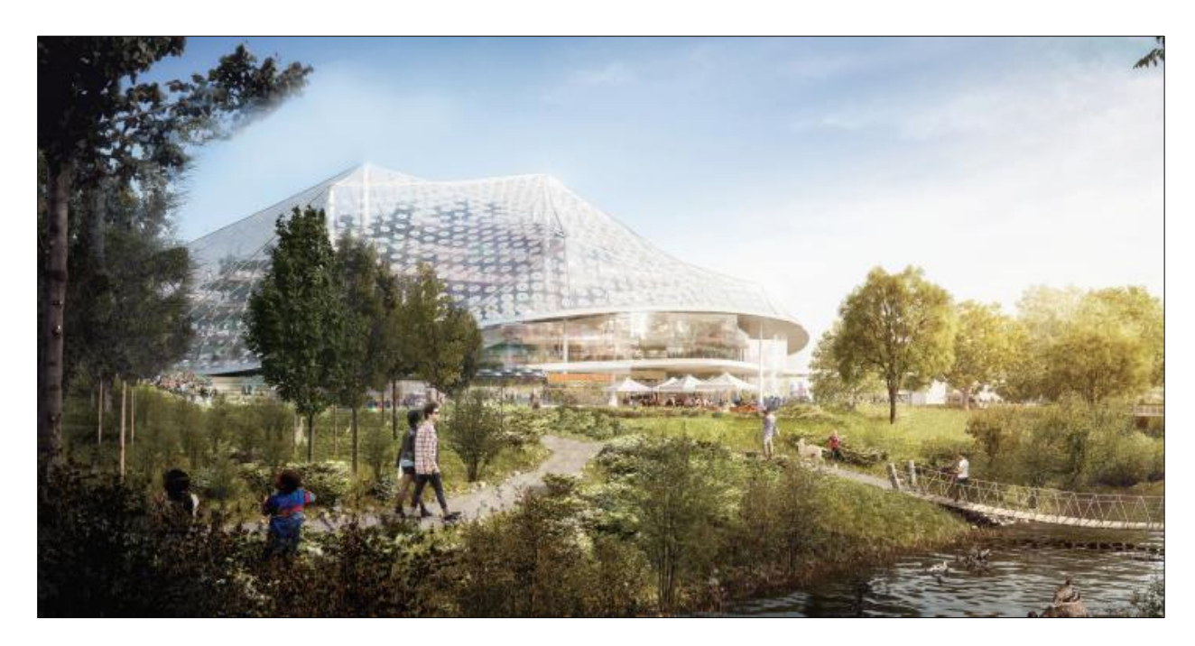
Google Landings 2015 Bonus FAR Design

Question 1: Does Council support the design direction for Google Landings?