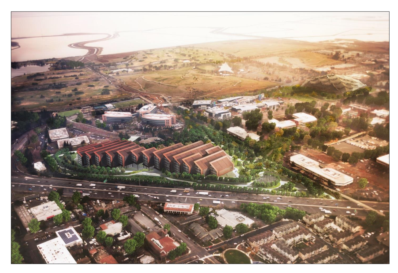
Google Landings Office Building

The office plans show extensive landscaping and native oak planting on a northern portion of property at 1875 Charleston Road, currently not owned by Google (see Page G008 of Attachment 1). The property owners of 1875 Charleston Road are aware of the project and this submission to the City. Google and the property owners are continuing to negotiate a deal to allow for the landscape improvements currently shown on 1875 Charleston Road. Discussions so far have been positive and must be resolved prior to the final Council approval of the project if this landscaped area currently in the plans is to remain.