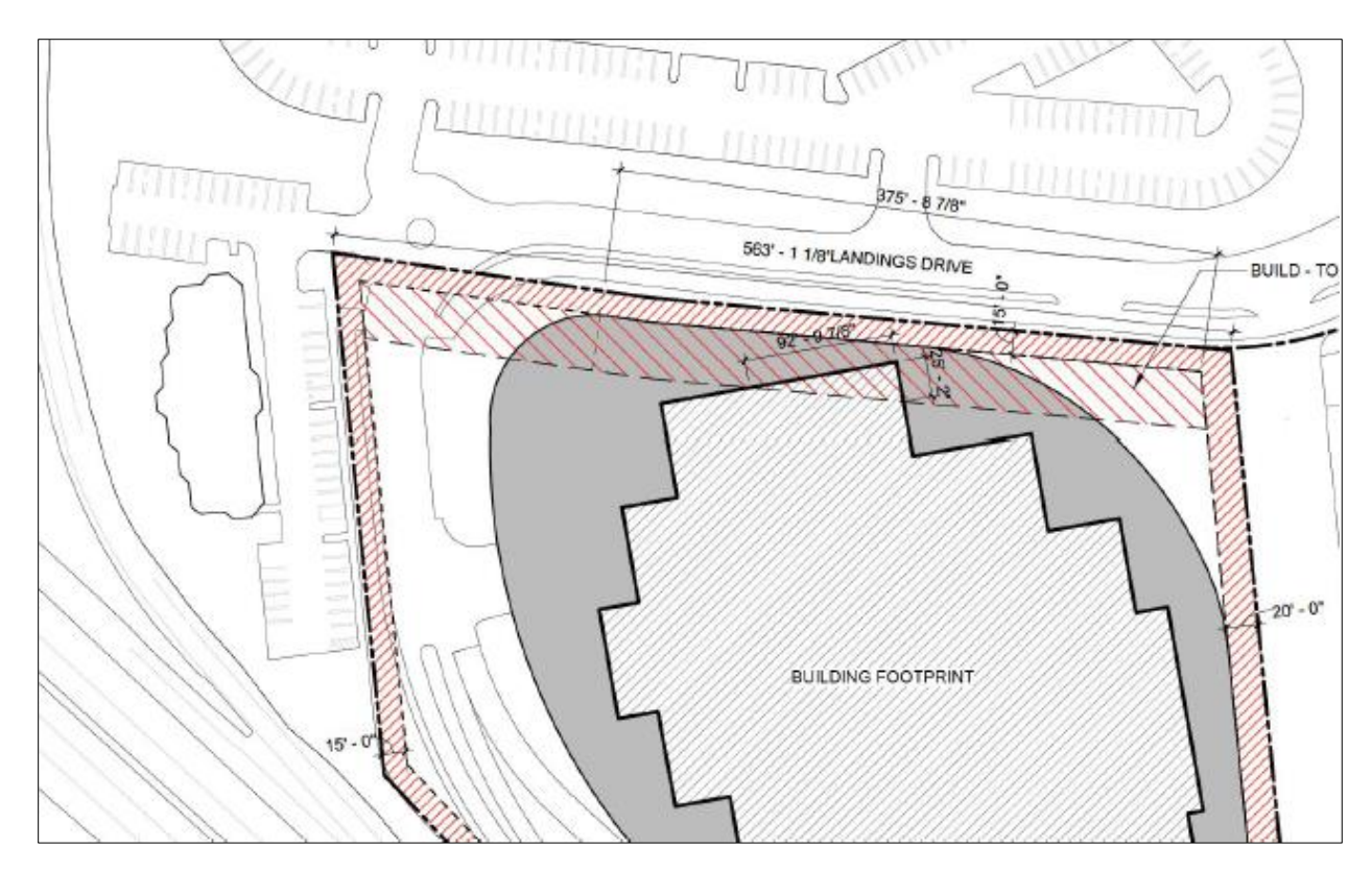
Build-to Area Graphic

along Landings Drive where it connects to Charleston Road are considered the front. This side was chosen because much of the rest of the site faces Highway 101 or Permanente Creek. The area that fronts Charleston Road does not need to meet front requirements because it is within the HOZ. However, the northwest portion of the site would need an exception since only 31 percent is within the build-to frontage requirements.