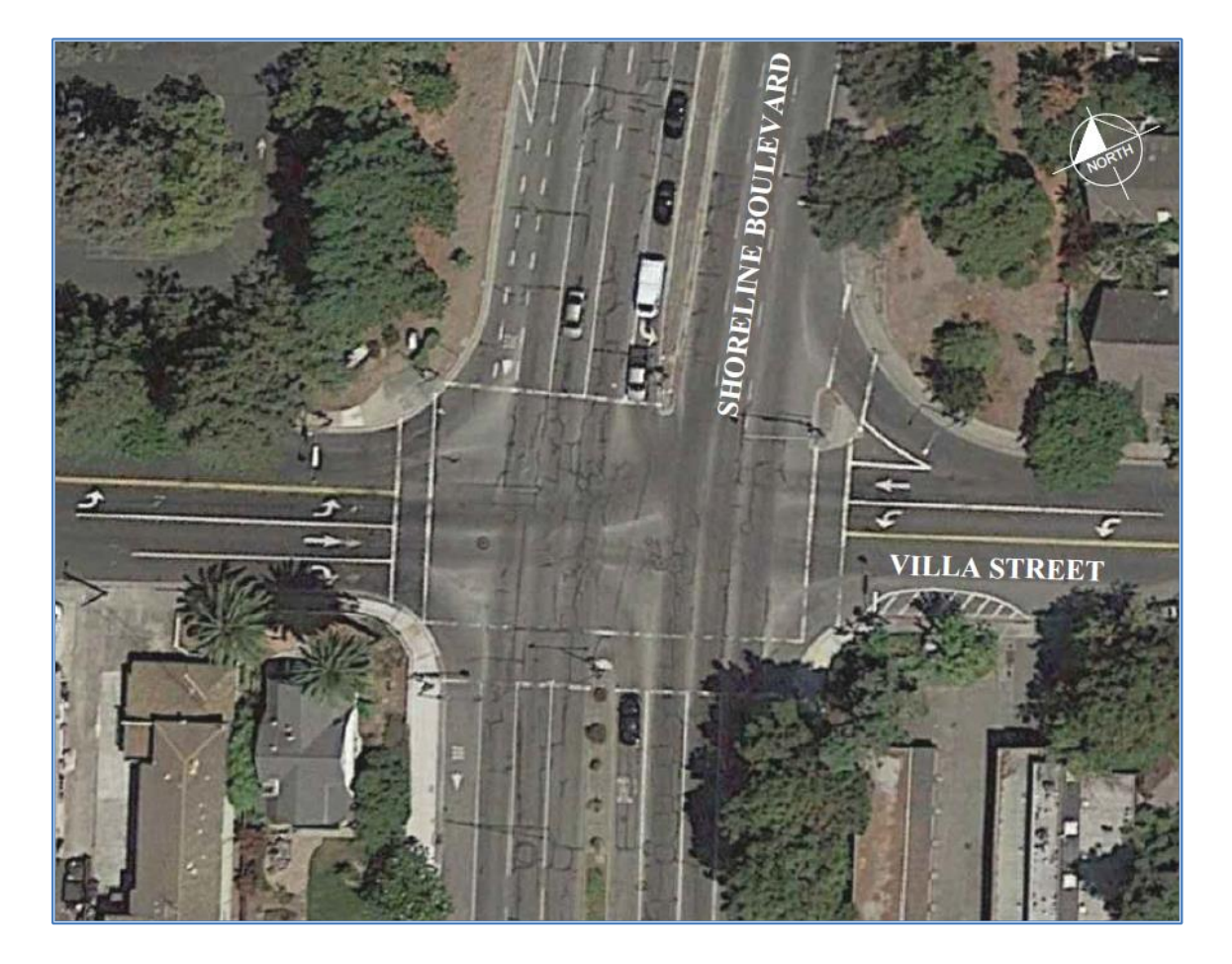
Figure 1: Existing Conditions

The existing signal operation presents conflicts where bicyclists on Villa Street cross Shoreline Boulevard in each direction at the same time vehicles make left turns from Villa Street. The left turn conflicts also exist for pedestrians crossing Shoreline Boulevard in the existing crosswalk on the south side of Villa Street. A free right-turn lane with a "pork chop" island exists at the northeast corner of the intersection creating conflicts between relatively fast, right-turning vehicles and bicycles/pedestrians. The northwest corner radius is very large, encouraging southbound drivers on Shoreline Boulevard to make right turns at relatively high speeds onto westbound Villa Street. No pedestrian crosswalk exists on the north side of this intersection.