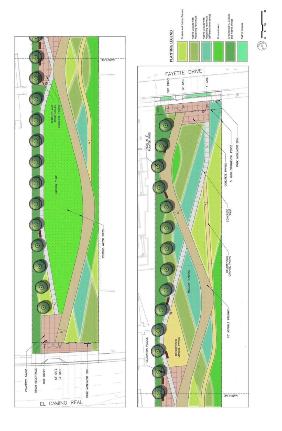
Figure 2: Fayette Park Layout Plan