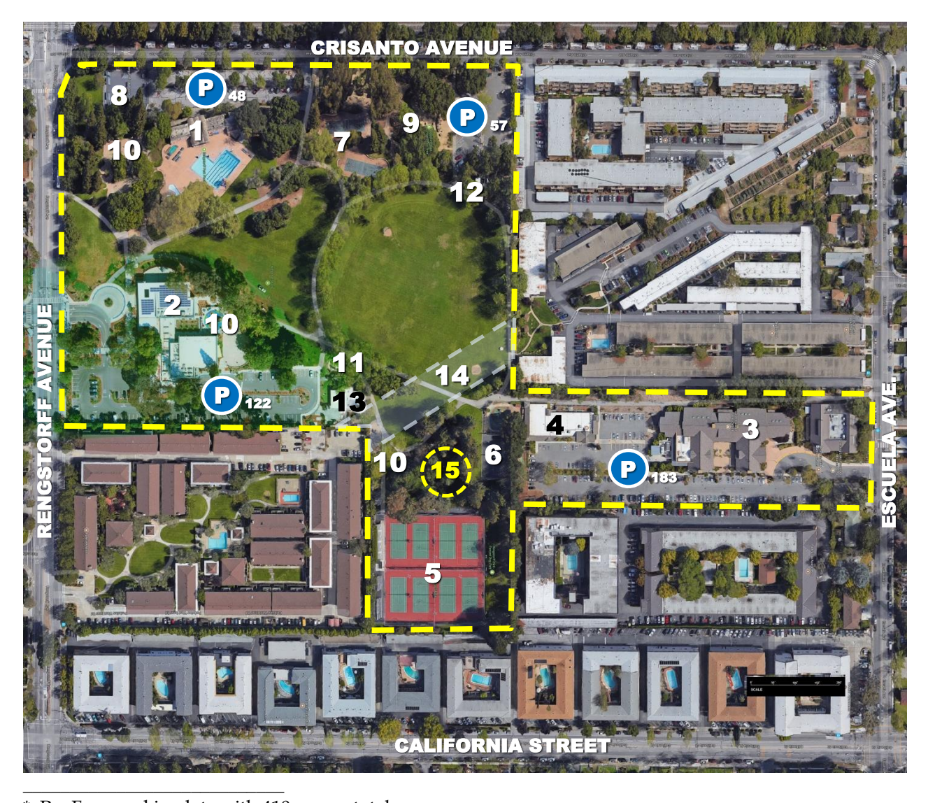
Figure 1: Rengstorff Park Annotated Map

The City is in the process of developing a "Magical Bridge" all-inclusive play area (No. 15 above) to the north of the existing tennis courts. This future facility is anticipated to be constructed in the next few years.