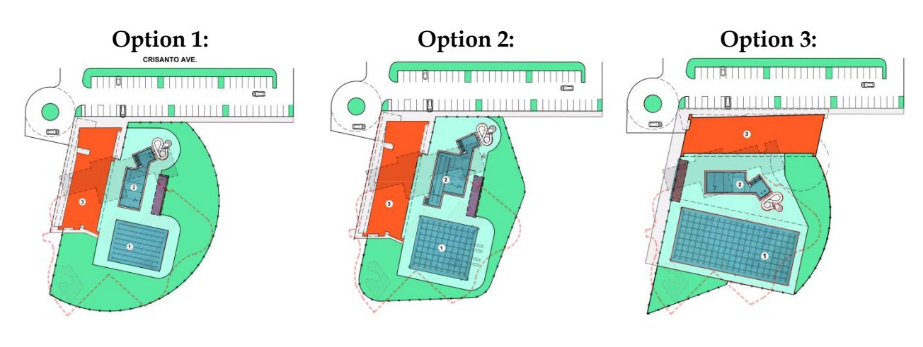
Figure 2: Scope Option Diagrams