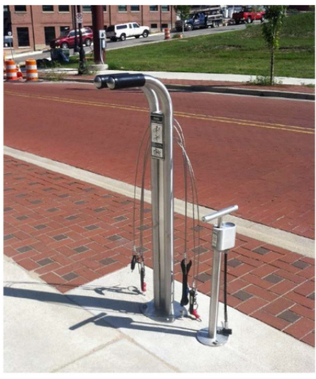
Example of Bicycle Repair Station