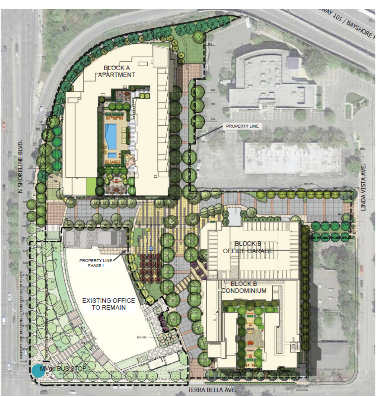
Plate 2 Project Site Plan