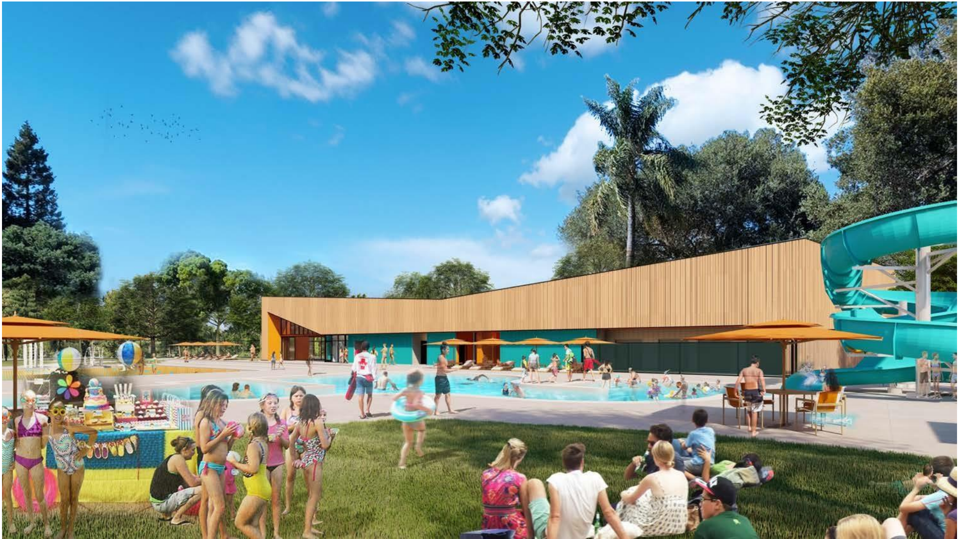
RENGSTORFF PARK AQUATIC CENTER