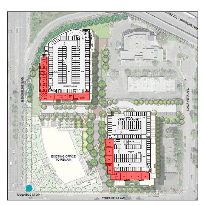
Garage Wrap Diagram – Units/Common Area Wrapped Around Garage

Underground parking has been required for nearly all recent residential developments in the City. Above-grade parking structures have been allowed in most office developments. From a site development perspective, underground parking provides for more efficient use of limited space, greater open space opportunities, and active ground-floor uses.