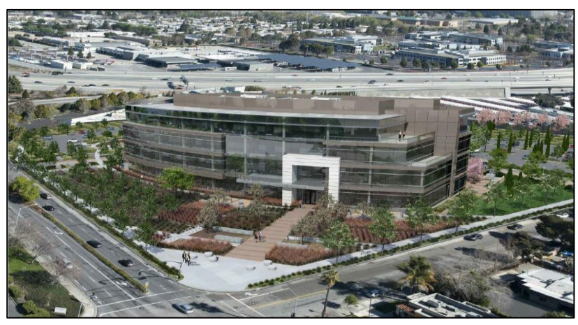
Office Building Elevation