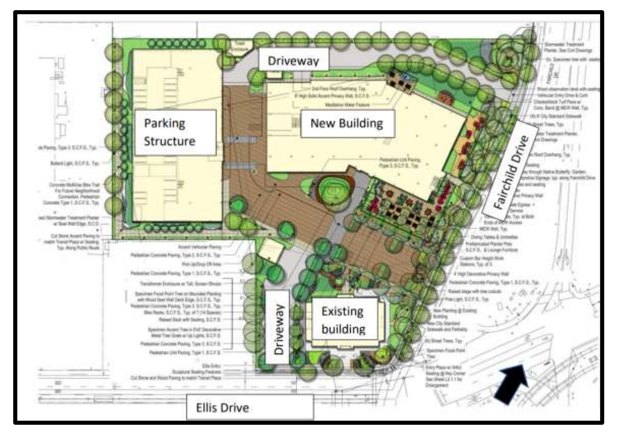
Figure 3: Site Plan

vehicle access to the parking garage would be provided from a driveway on Fairchild Drive and from Ellis Street.