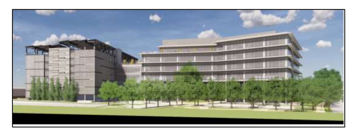
Figure 5: East Elevation

The parking structure, as designed with the mesh screening and artful pattern/texture to the exterior wall portions, add visual interest and complement the building. Trees have also been incorporated to provide a softer landscape buffer.