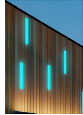
RECESSED LED LIGHT FIXTURE SIZE: 4"W x 2'-6"H