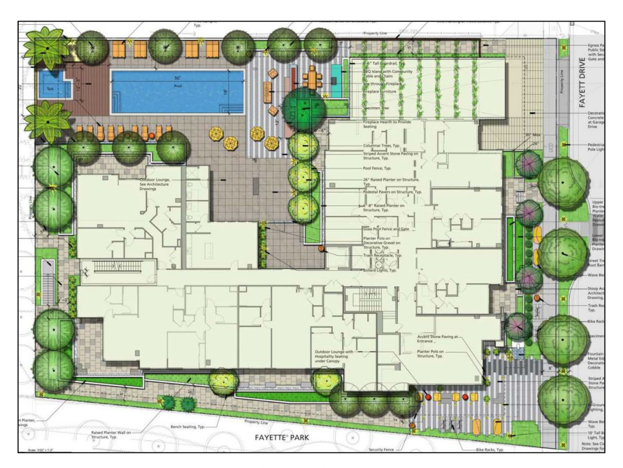
Figure 3: Site Plan

The proposed six-story residential building includes 44 units and a two-story underground garage. The total building size is 72,620 square feet (2.5 FAR) and includes five one-bedroom units, 18 two-bedroom units, and 21 three-bedroom units. Octane is requesting a vesting tentative map for condominiums and intends to sell the units. The project is proposing a GreenPoint rating of 110 points, which is consistent with other residential projects recently built in the City and exceeds the City's green building requirements.