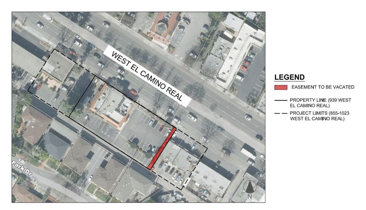
Figure 1: Existing Easement

On December 17, 1979, the City was granted a 10' underground utility easement over a portion of the subject property (see Figure 1). Existing Pacific Gas and Electricity (PG&E) utilities are located within the easement and serve the existing buildings proposed for redevelopment at this location.