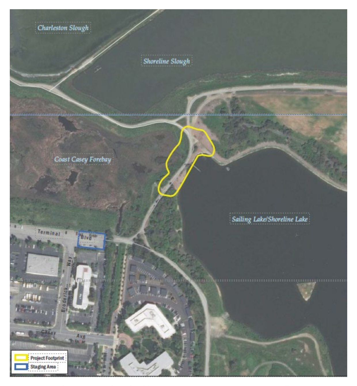
Figure 1: Location of Sailing Lake Access Road Improvement Project

Lake Dam, No. 7000-142, Santa Clara County. Any repair work requires review and approval from DSOD.