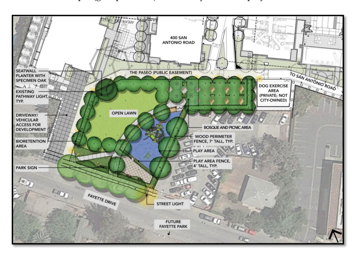
Figure 3: Conceptual Plan F (Recommended Concept)

Three revised concepts were presented to the PRC on February 24, 2021 in response to their comments (see Attachment 3), and the PRC unanimously recommended Conceptual Plan F to the City Council. Additionally, members from the community attending the PRC meeting provided support toward Conceptual Plan F, specifically favoring the addition of the bosque (group of trees) and the layout of the play area.