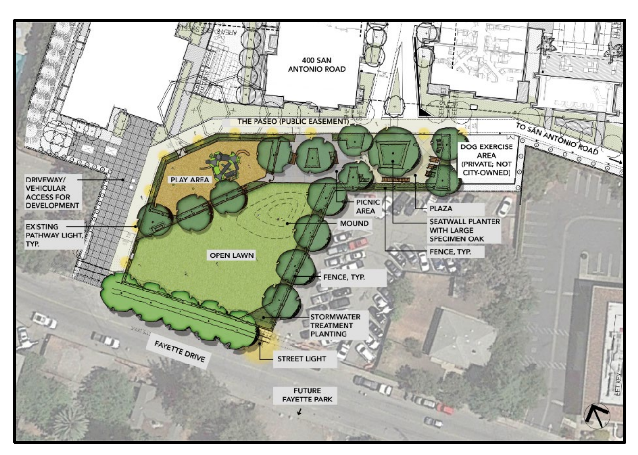
Figure 2: Conceptual Plan C