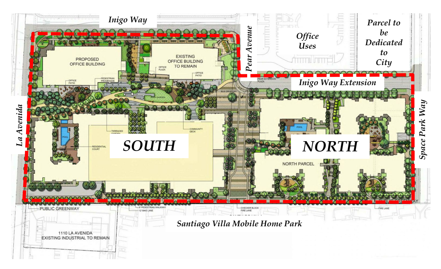
Map 2: Approved Site Plan

The south and north areas are shown in Map 2. The project includes properties owned by both Sobrato and Google LLC (Google). Google properties are called out in Map 3 below.