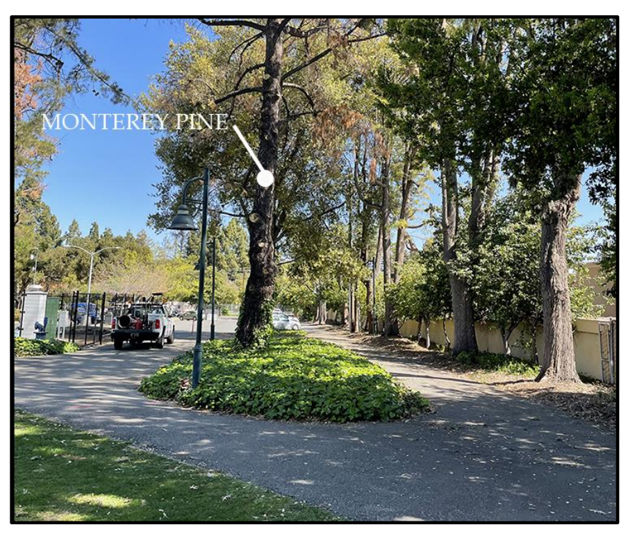
Figure 6 – Monterey Pine Tree at Proposed Maintenance Building Site