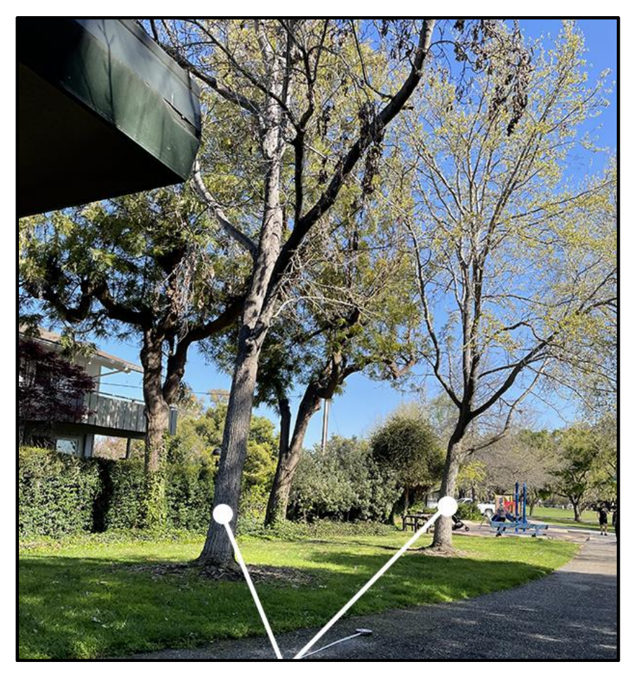
LIQUIDAMBAR TREES Figure 4—Liquidambar Trees at Tennis Building

Located behind the building are three silk oaks recommended for removal due to poor structure, health, and proximity to the new restroom building. These trees are Heritage trees and were planted as part of the original development of Rengstorff Park. (See Figure 5-Silk Oak Trees at Tennis Building.)