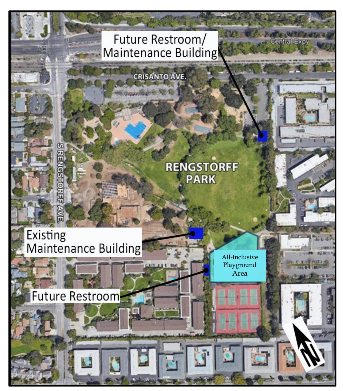
Figure 1 – Project Site Map