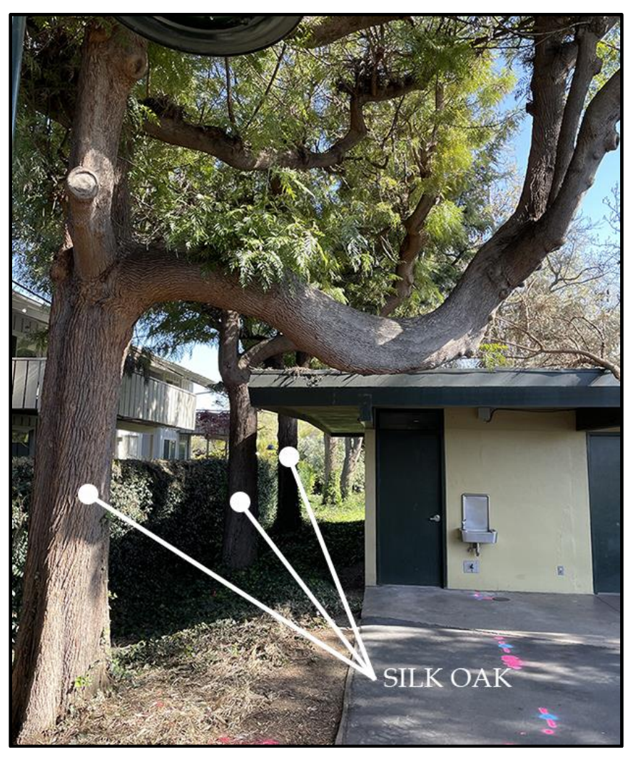
Figure 5 – Silk Oak Trees at Tennis Building

A single dead Monterey pine tree at the new maintenance building site will be removed and is the only tree affected by the proposed new building. (See Figure 6-Monterey Pine Tree at Proposed Maintenance Building Site.)