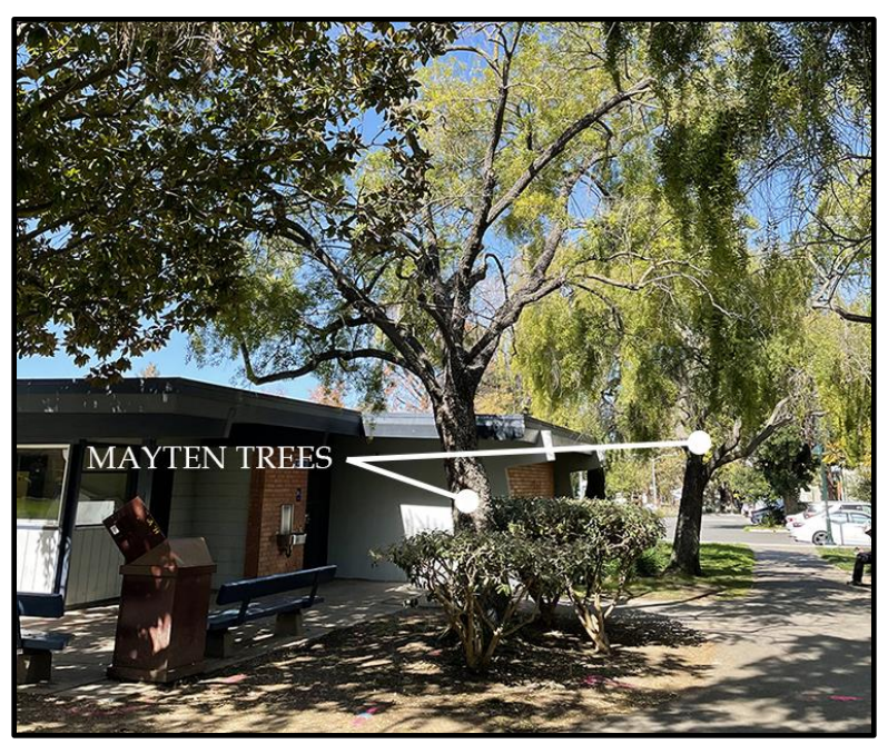
Figure 2-Mayten Trees at Maintenance Building

The red oak is a Heritage tree growing above the SFPUC pipeline, and staff anticipates SFPUC engineers will request its removal as we collaborate to obtain permission to install a new path over their property and drive heavy construction equipment needed for these projects. (See Figure 3-Red Oak at Maintenance Building.)