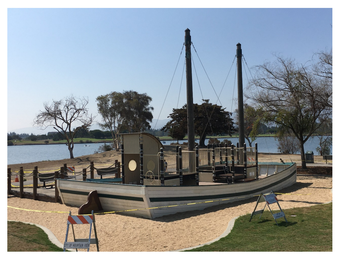
Photo 2: Existing Custom-Built Shoreline Sailing Scow Play Structure