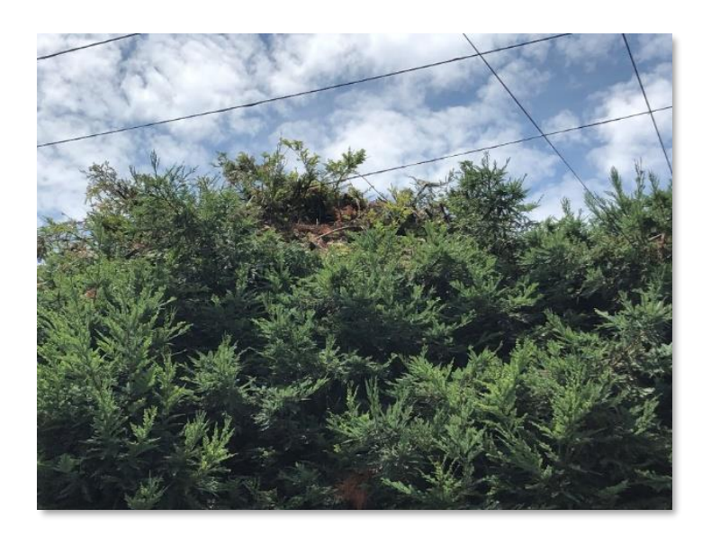
Figure 3: Tree Proximity to Secondary Lines