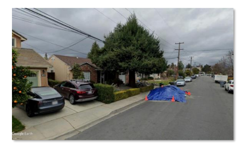
Figure 1: Tree Proximity to Power Lines

Based on the inspection and evaluation of the tree, staff approved the removal based on utility power lines interference (Figure 1) and because the tree has been topped.