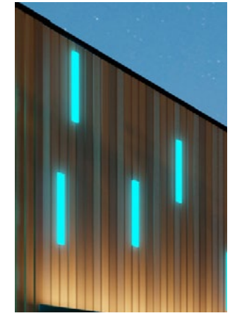
RECESSED LED LIGHT FIXTURE SIZE: 4"W x 2'-6"H