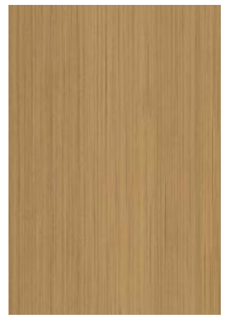
INNOWOOD (COMPOSITE WOOD) AMERIAN OAK EMBOSSED & EMBEDDED WOOD GRAIN V-JOINT SHIPLAP BOARDS SIZES: 4" x 13'