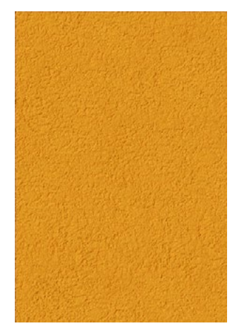
CEMENT PLASTER PAINTED ORANGE VERTICAL REVEALS