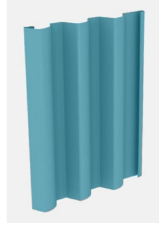
CENTRIA METAL PANEL CASCADE CC-260 - VERTICAL PROFILE