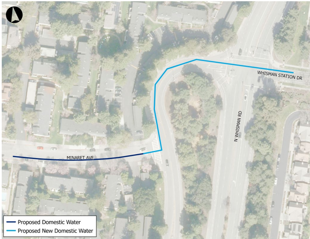
Figure 2: Minaret Avenue and Whisman Station Drive