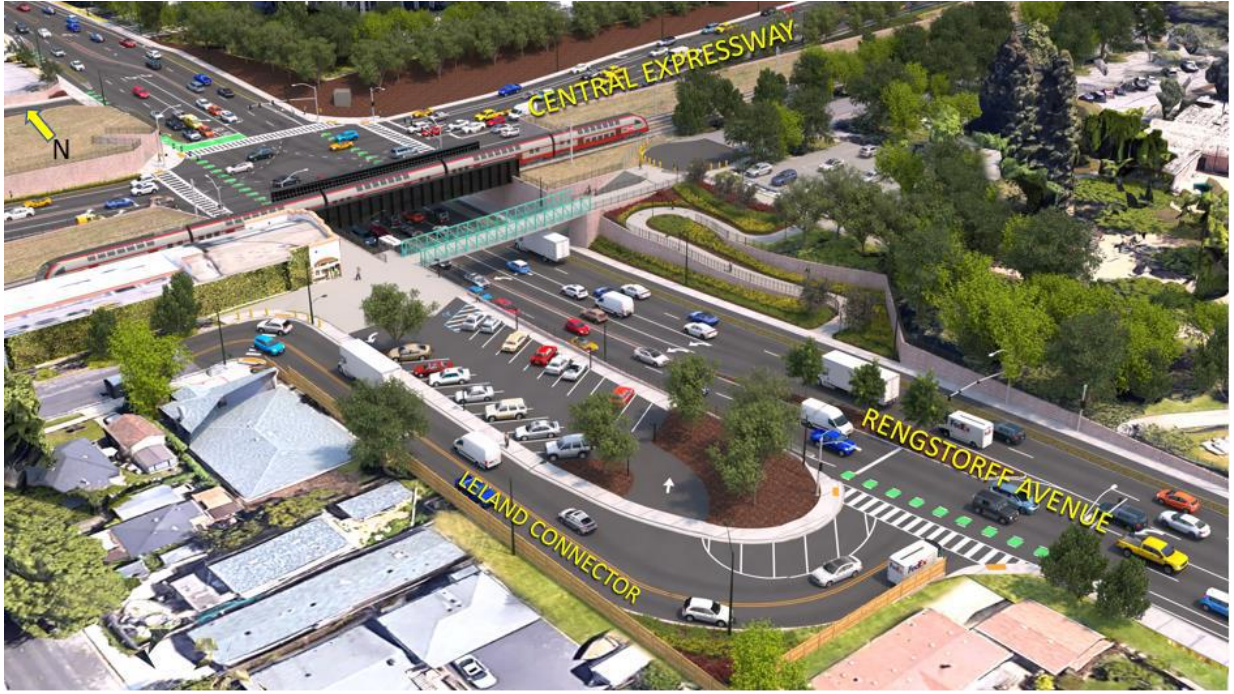
Figure 4: View from Southwest of the Rengstorff Avenue and Central Expressway Intersection