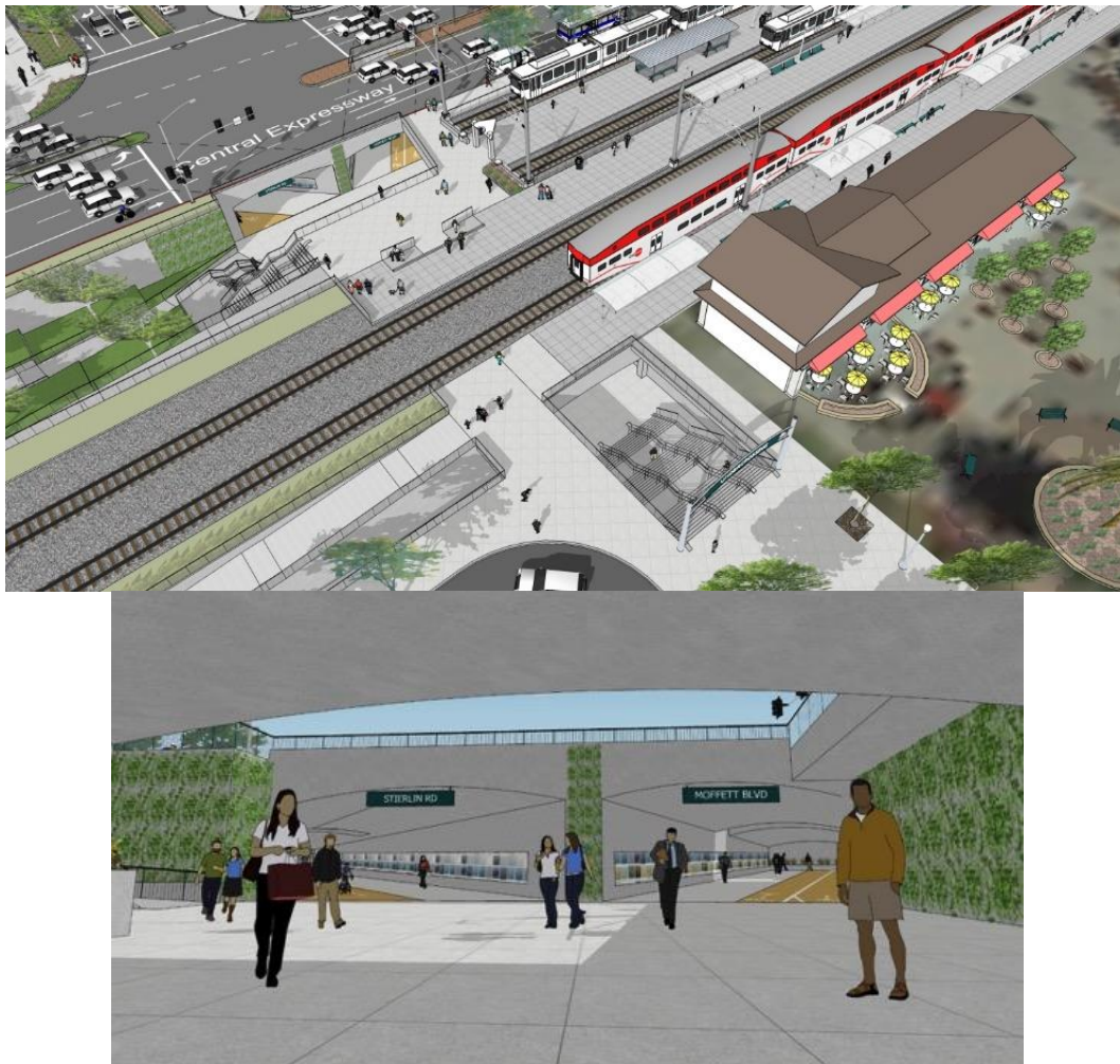
Figure 2: Castro Street Grade Separation Project Renderings

The design concept for the grade separation was included in the Transit Center Master Plan, approved by the City Council in May 2017. The project is currently in the 65% design phase. Table 1 provides the history of City Council actions and recent milestones for the project.