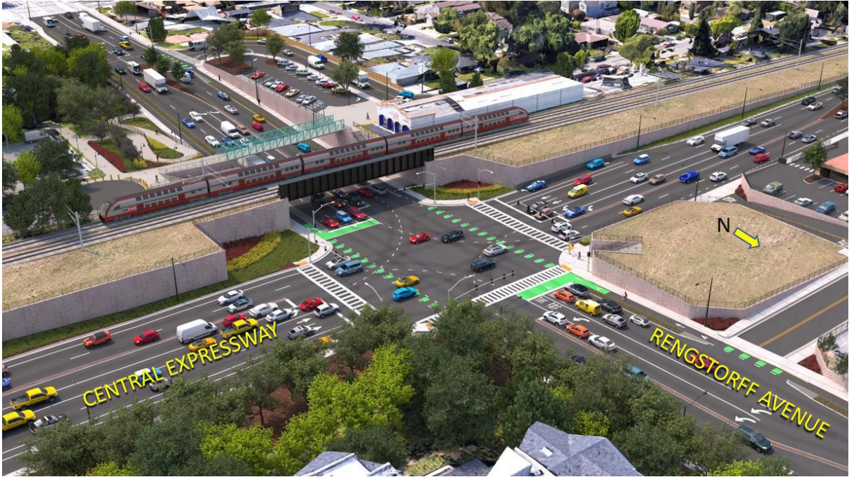
Figure 3: View from Northeast of the Rengstorff Avenue and Central Expressway Intersection