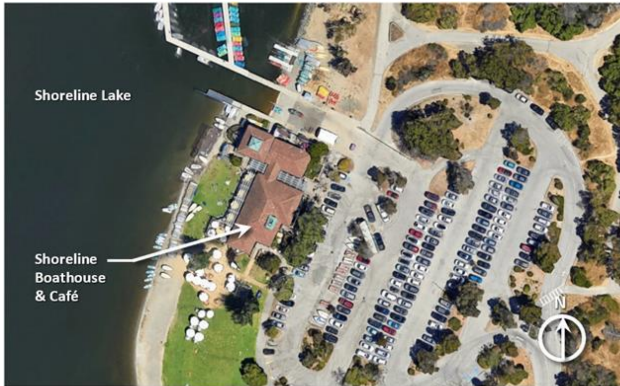
Figure 1: Shoreline Boathouse Site

Shoreline Boathouse is located at 3160 North Shoreline Boulevard, Mountain View, CA 94043 (Figure 1). The Boathouse is located off the shore of Shoreline Lake at the Shoreline.