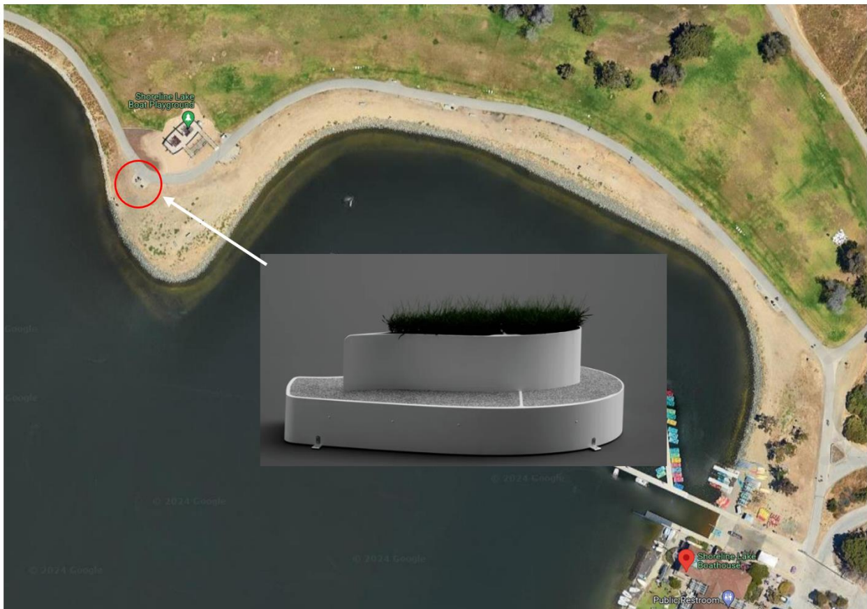
Figure 4: Additional Art Opportunity at Shoreline at Mountain View