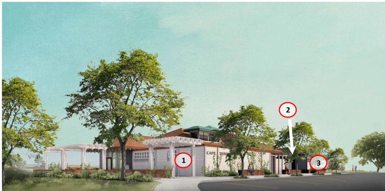
Figure 3: Rendering of Shoreline Boathouse Expansion