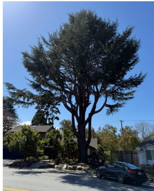
Figure 2: Street View Which Shows the Tree of Concern from the Street