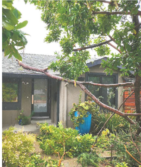
Figure 3 and Figure 4: Photos of Prior Limb Failures Which Reflect the Normal but Problematic Branch Elongation that Leads to Limb Failures When it is Not Adequately Addressed