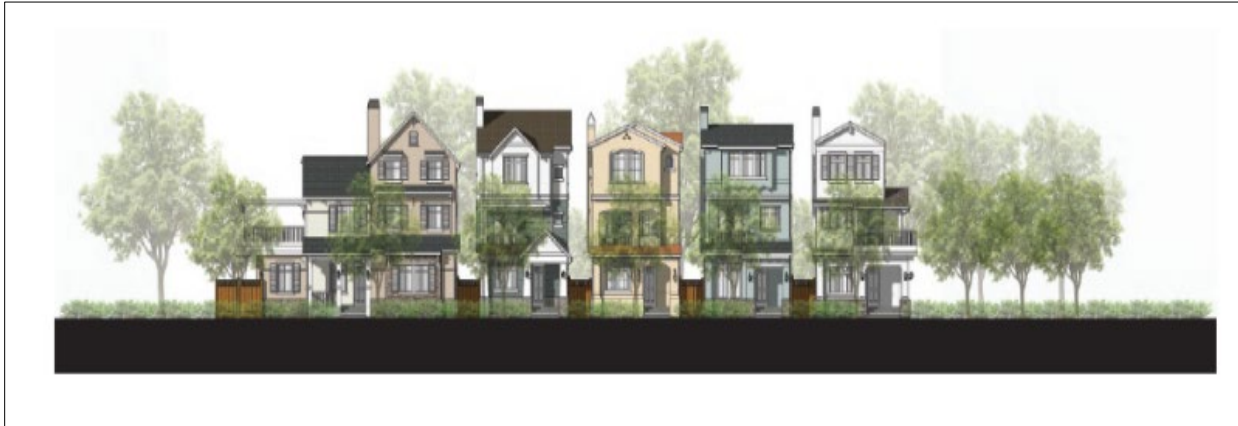
View from Easy Street