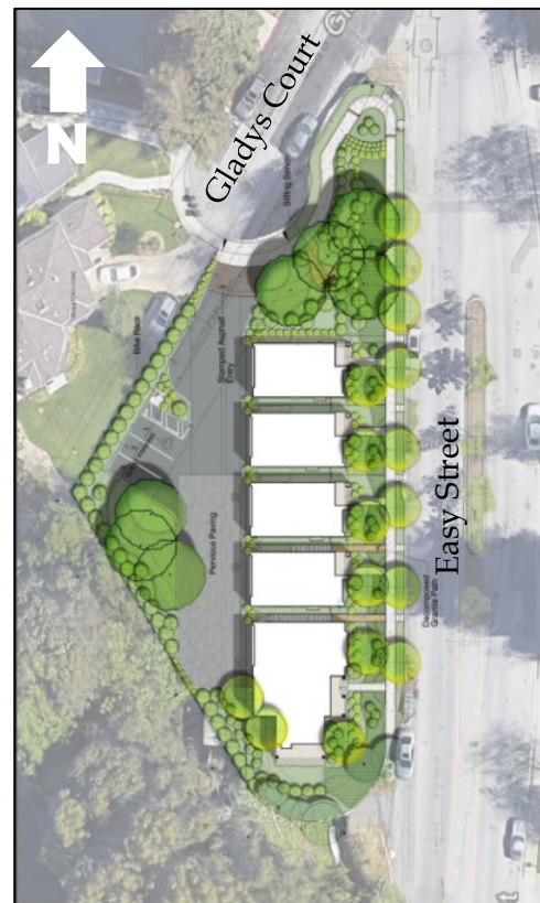
Figure 2—Site Plan

The design of the units incorporates traditional architectural elements such as porches and balconies, wood railings, corbels, trellises, shutters, and gable, hip, and shed roof forms. Exterior materials include stucco and horizontal siding, accented by decorative stone veneer, and composition shingle and tile roof materials. Units are differentiated through massing, varied roof forms, projections and offsets, porch elements, and exterior materials and colors.