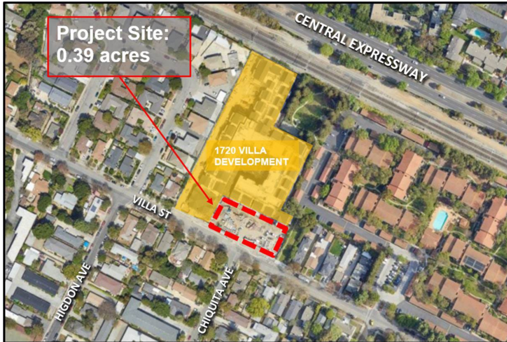
Figure 1: Project Site

The Conceptual Plan (Figure 2) includes the following elements: