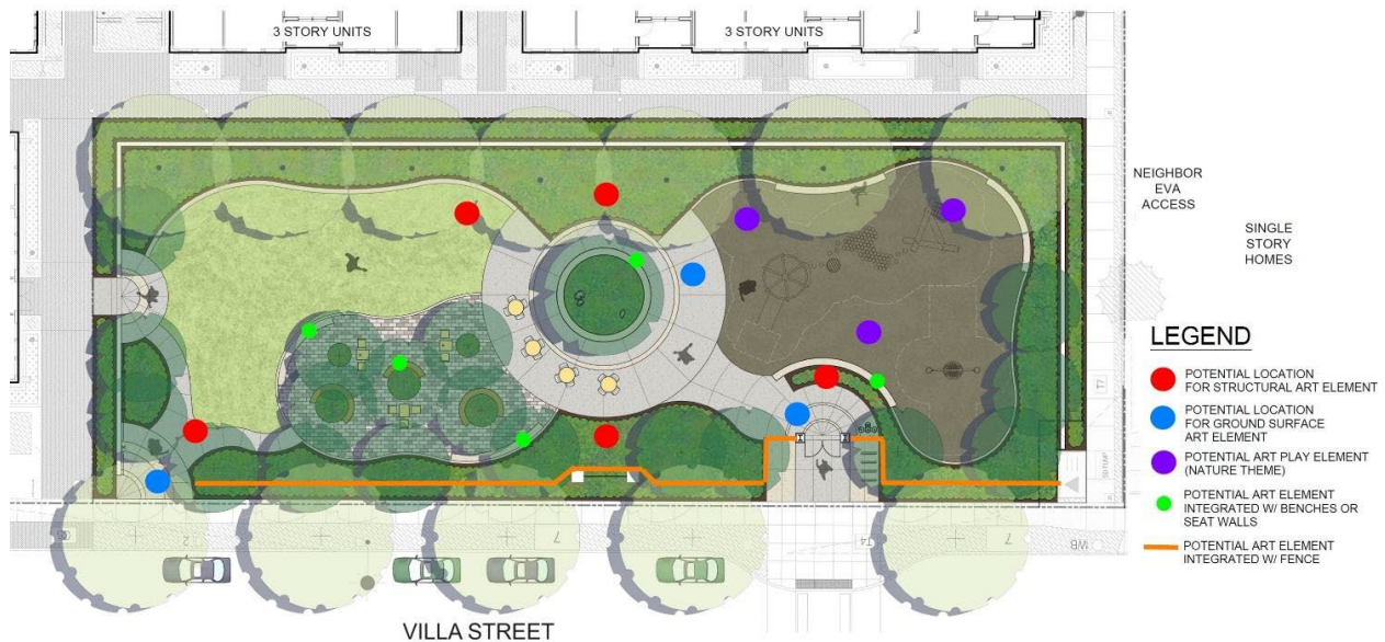
Figure 2: Approved Concept for Villa-Chiquita Park and Potential Art Locations

Council also approved placing signage within the park to provide historical information about Club Estrella, the primary social club of the local Mexican-American community, which was founded in 1948 just one mile from the future park. The club's purpose was, and still is, to promote Mexican-American culture in a social atmosphere as well as to assist community members in need.