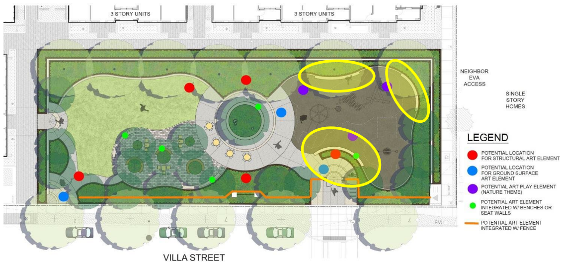
Figure 5: Proposed Locations for James Dinh's Artwork

Staff and the artist have determined that the best location for the proposed artwork is to be integrated within three concrete seat walls in the playground area (Figure 5, locations highlighted in yellow).