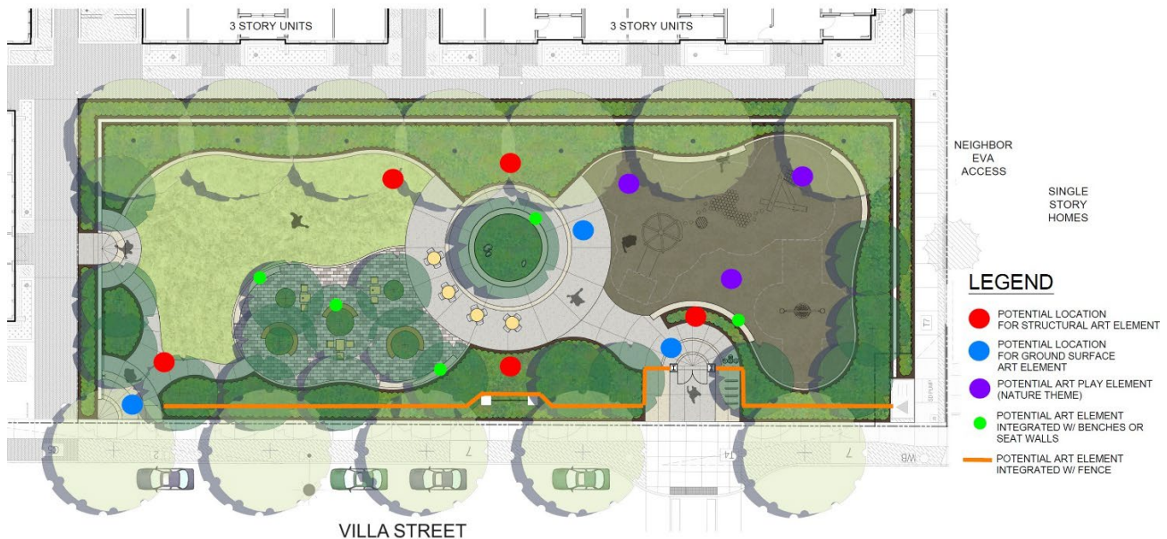
Figure 1: Approved Concept for Villa Park and Potential Art Locations

Several art opportunities exist on the site. Figure 1 shows the approved concept for Villa Park and suggested areas where art can be located.