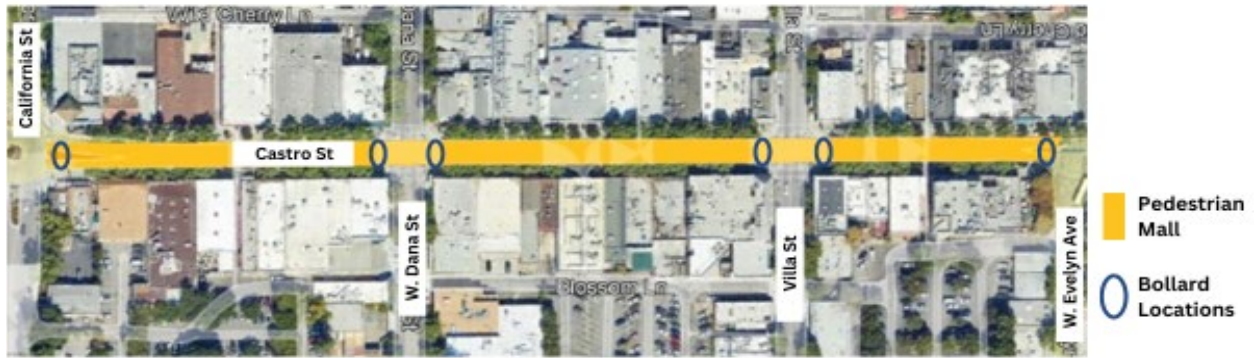
Figure 2: Castro Street Bollard Locations

Art proposals must include a concept featuring two bollards accompanied by a color sketch or photo, a title, a detailed description, an estimate of material costs, and any specific requirements. Additionally, the VAC could identify a theme (or themes) for this project, which would further focus the call for artists.